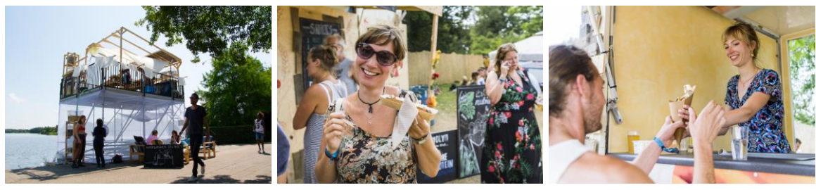
Figure 4. Illustrational images of Experience projects at WTTV: Hair-Washer District, Vegandel, &Cricket