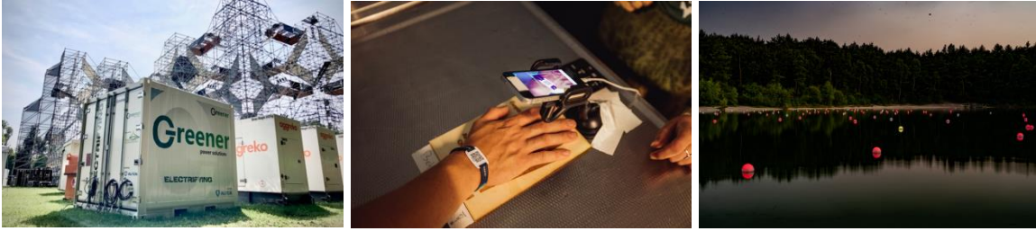
Figure 2. Illustrational images of Test & Implementation projects at WTTV: Greener, Loyal Garden, and LILY.