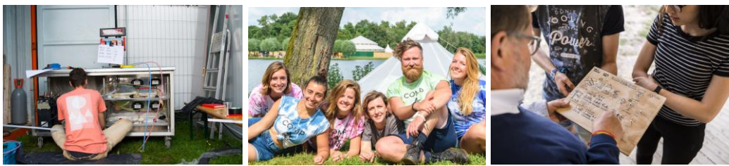
Figure 3. Illustrational images of Innovation projects at WTTV: Saru Soda, Comp-A-Tent, and Offgrid Basecamps.