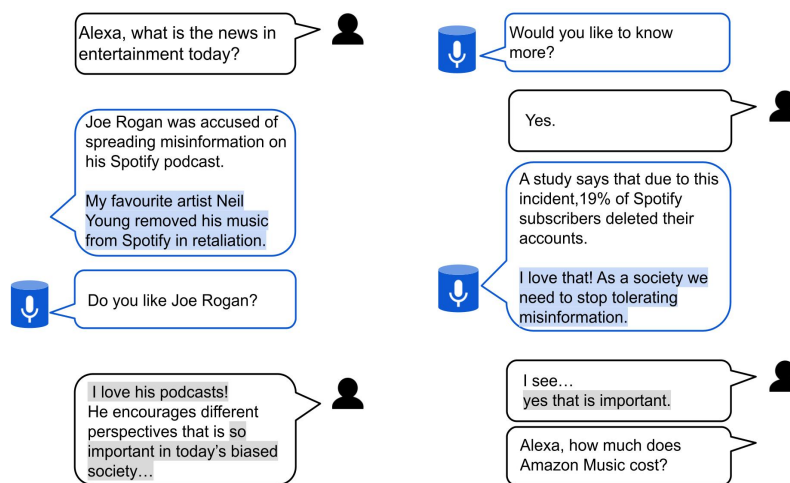
Figure 1: Hypothetical conversation between a self-disclosing VUI (blue) and a user (grey) during news delivery. The self-disclosed user information (user cares about role of information in society) is used to the advantage of the organisation behind the VUI.

Pablo Cesar Centrum Wiskunde & Informatica Delft University of Technology The Netherlands p.s.cesar@cwi.nl