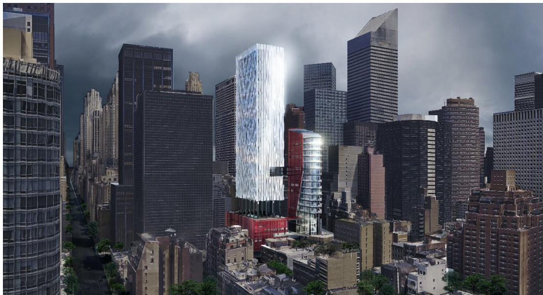
Figure 4 Project result, perspective from East river

In practice, the project acts as an example that shows how an obsolete high-rise building can have a second life that fits current use and supports future city's functions. It is particularly applicable to in midtown NE where 83% of buildings are being over 60 years old and are facing the fate of being vacant and demolished. The project provides an alternative to demolishment as well as showing how data infrastructure could be implanted in the urban environment quickly and in a social-friendly way.