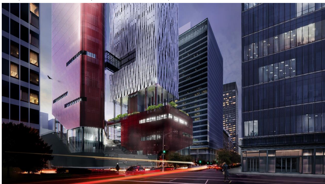
Figure 3 Visible public space on mid-level.

The project results in a revolution in current fortified data center typology which ensures high security in server space and at the same time free up the public ground for local communities. Through the move of putting the server space in mid-air, the architecture expresses the server hall to be visible and transparent to public. It gives idea to the public the physical form of their personal data and how the professionals are. Despite the fact that privately-own-public-space are commonly seen in Manhattan, public space is found mainly on ground level and provides only with limited furniture or even an empty plaza, which is not welcoming to social activities. The new design contributes to the community by providing an elevated public street which shared amenities with the startups office on multiple level and leads the public to the mid-level open terrace.