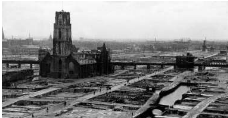
Fig. 5: The city of Rotterdam after bombing Retrieved from U.S. Defense Visual Information Center. Nr: HD-SN-99-02993.

Bombs were mainly dropped on the medieval city center and the residential areas of Kralingen and. The buildings immediately went up in flames and spread uncontrollably across the city center, merging into a firestorm. Around 2.6 square kilometres of the city was destroyed as seen in fig. 5 (Brongers, 2004).