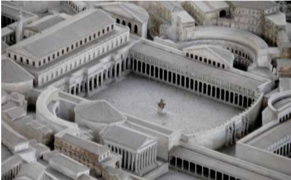
Fig. 9: Reconstruction of the assembly of the market of Trajan's Forum Retrieved from https://statuiededaci.ro/en/trajan-s-forum/3d-models-and-reconstructions

The first documented structure with multiple individual shops was in ancient Rome as part of the Imperial fora. The Imperial fora was a colossal structure that features a series of monumental fora (public square) that were the centers of politics, religion and economy in the Roman Empire. The Forum of Trajan, depicted in fig. 9, was one of these public squares which included in its structure 150 shops on various levels selling wine, grain and oil (Pevsner, 1979, p. 235). The market was not yet its own building, but instead made a part of the overall structure of the city center of Rome.