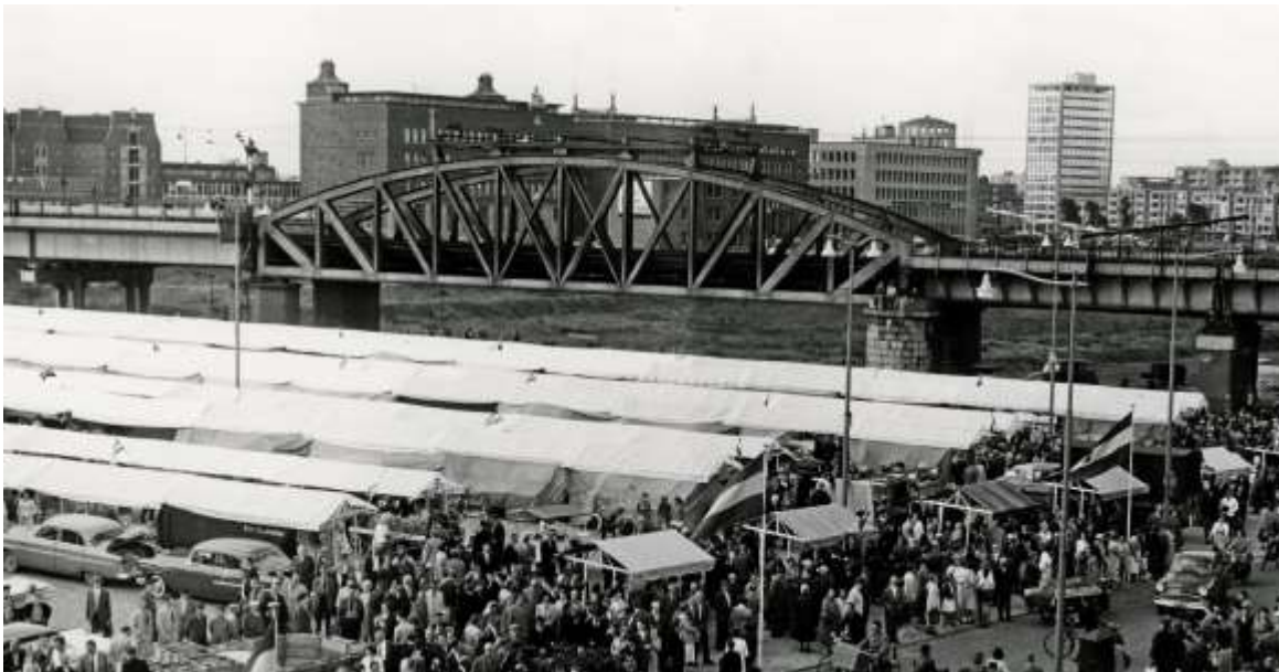
Fig. 7: The lanes of the market stand

In 1958 the weekly market returned to its original spot on the Binnenrotte in the city. With 465 stalls and an average of 70.000 visitors; it is the most famous market in Rotterdam ('Market on the Binnenrotte', 2015). The Binnenrotte market multiplied the hallway of market stands from the Goudsesingel market into multiple lanes. These lanes were organized to fit within the larger structure of the Binnenrotte square. As can be seen in fig. 7 the construction is made up of bars that hold up the roof and table. The construction is symmetrical, yet each side is organized with its own function. The one side is meant for the visitors of the market, while the other side is used by the vendors.