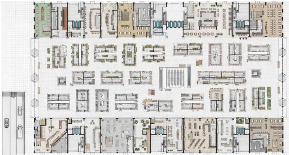
Fig. 12: The Markthal ground floor plan

The Markthal in Rotterdam is a building that is composed of a 40 meter high arch, under where you can shop, park, eat out, sit on a terrace or even live. A secure, covered hall is nestled beneath the large arch, conceived as an entirely new take on a typical market building. The Markthal accommodates contains more than 80 fresh produce and catering businesses with built-in market stands. The sides of the arch also accommodate 20 retail units, restaurants and cafés (Fernández-Galiano, 2016, p. 78). The layout of the market combines the ideals of the market hall and the market hallway. The sides of the market are rows of stores, while the hall holds different market stands distributed across the hall.