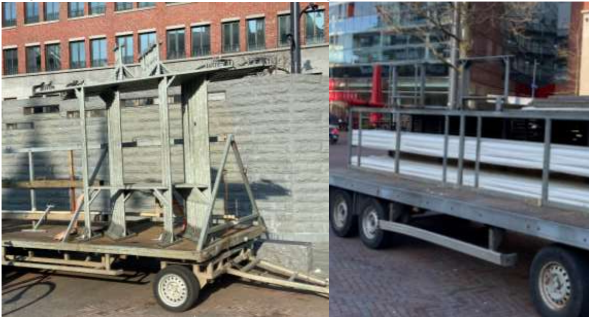
Fig. 14: The metal construction of the street market

This market takes place on the Binnenrotte square twice a week. Like most temporary markets, its construction is detachable thus it can be set up and deconstructed in a quick manner. This structure is provided by the council of Rotterdam. The market stands are constructed by the metal roof structure shown in fig. 1 and various other elements like the roof and table constructions shown in fig. 14. These are brought to the square on the trailers shown in both figures.