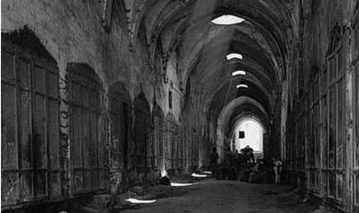
Fig. 10: The Cotton Market of Jerusalem

Jerusalem also had a building specialized for the sale of one type of ware, yet this was not just an open hall (Pevsner, 1979, p. 235). The Cotton Market can be seen in fig. 10 and was organized as two rows of rooms (or stores) facing each other, connected by one roof. The connecting roof creates a hallway or street through the building between the rows of stores.