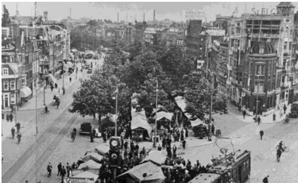
Fig. 4: The market of Goudsesingel ca. 1904. Retrieved from Collectie Stadsarchief Rotterdam. Nr: IX-938-01

The commodity market was located on the Botersloot up until 1904. The market then moved to the Goudsesingel with an estimate of about 1200 stalls ('Market on the Binnenrotte', 2015). As seen in fig. 4 the market stands of the Goudsesingel market were constructed into rows, creating a lane for the consumer to walk through. The organization of the market slowly started mimicking aspects of a building with lanes that resemble a hallway.