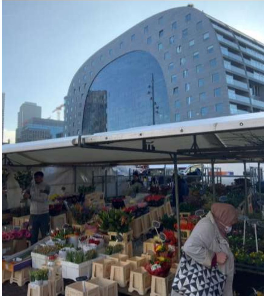
Fig. 8: The Markthal as part of the weekly market

The city of Rotterdam is also planning to refurbish the Binnenrotte Square to make it more attractive even on days when there is no outdoor market. The refurbishment will rearrange the markets so that the market lanes connect the entrances of the Markthal. This will allow the public to easily enter and exit the building and to create incentives between the two markets (Aguilar, 2021).