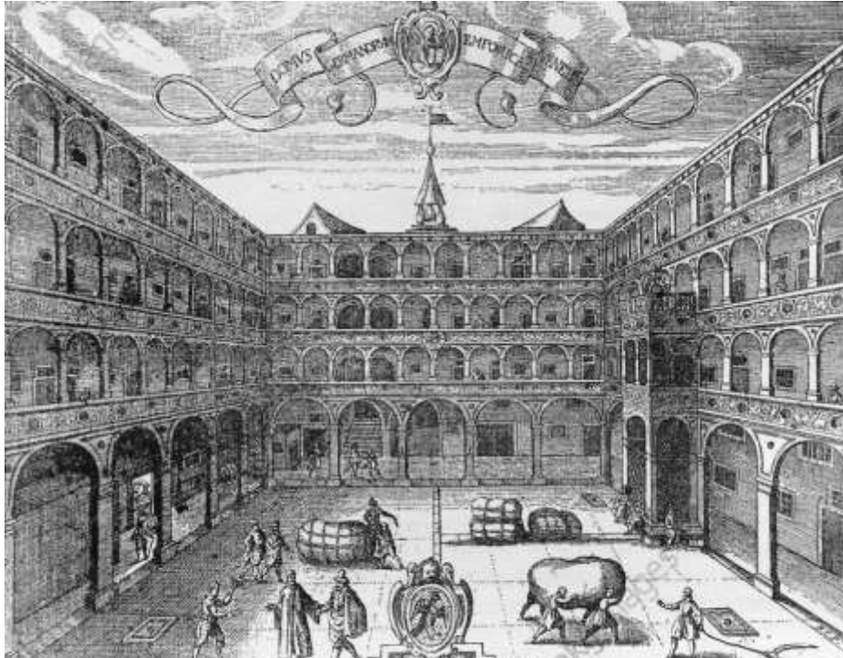
Fig. 11: The Fondaco dei Tedeschi by Raphael Custos (1616)

The English architect Charles Fowler made his own attempt at designing a market. Fowler designed the Covent Garden Market to regulate the messy market dealings happening on that square. His design had long ranges on an E-plan, which was three rows of stores that created two open squares between them (Pevsner, 1979, p. 238). This variant has elements of both the market hall and cloister type. In this case the open area is the hall and the cloister only goes around the three market sides with the roof connecting all the stores together.