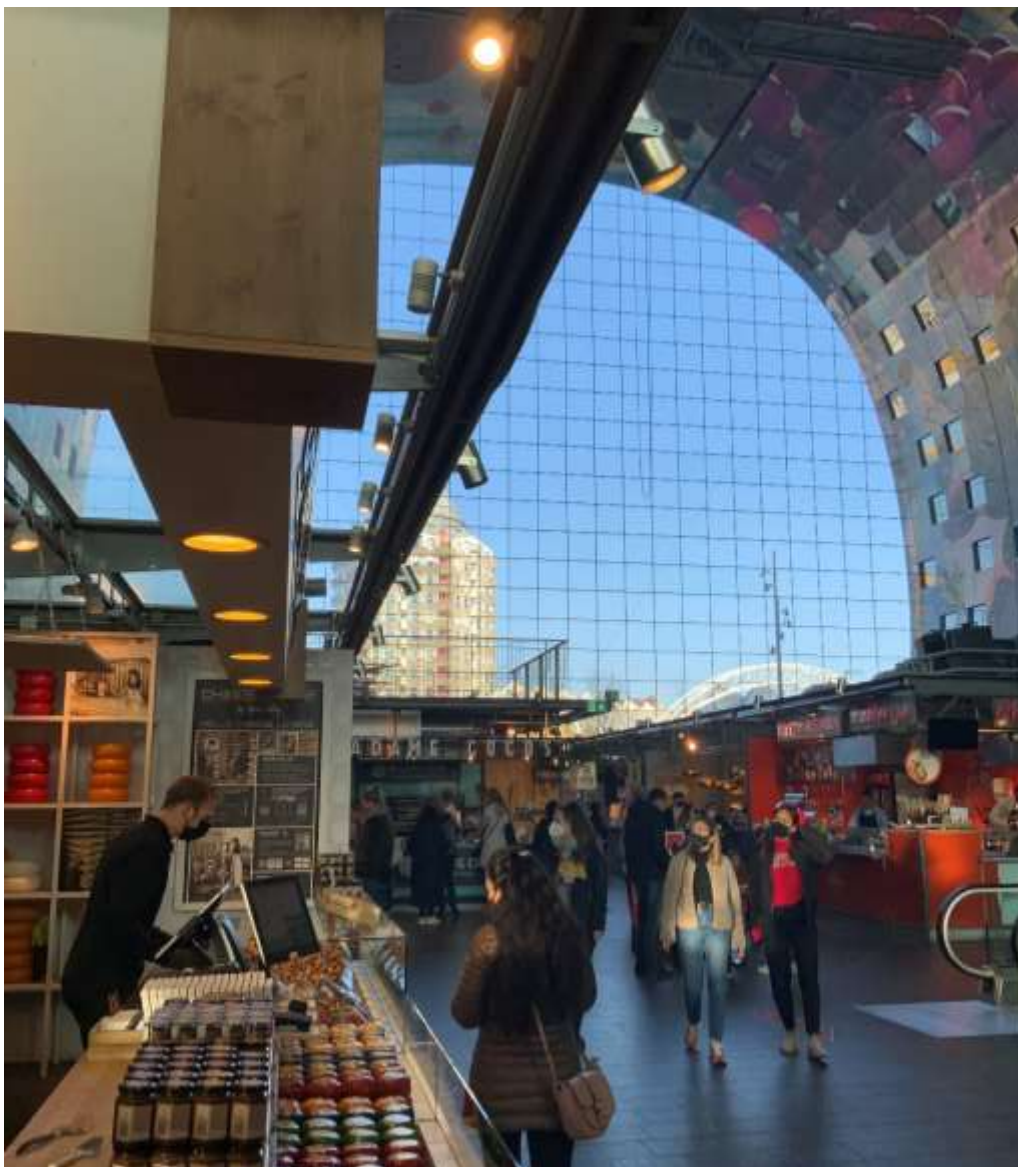
Fig. 13: The arch and façade of the Markthal by Author

The main reason the Markthal is so needed is its ability to control the interior climate. The Markthal is an energy efficient building, awarded a Very Good BREEAM rating. The thermic system of the building can function without any installations thanks to the glass façade. Fresh air flows in under the façade and rises towards the roof where it leaves the hall through the ventilation shafts in the roof. The hall is naturally ventilated, yet it has a central monitoring system that is used to exchange heat and cool air between the different programs. In this way less installations could be used than normal for these programs (Aguilar, 2021). The 40 meter high arches cover the market while the glass façade controls the interior climate from any weather influences that could influence the food.