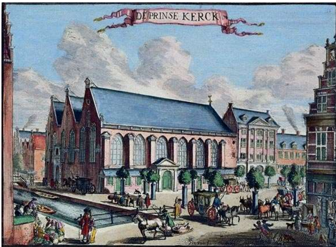
Fig. 2: The market by the Botersloot Nr: RI-746

Rotterdam has a rich history of trading, yet the oldest known market that received official status was the market by the Botersloot in the old center. The Botersloot was a canal in the center near Blaak and owes its name to the dairy farmers who brought their wares to the city via the Rotte (Vocke, 2019). The name is literally translated to butter canal. As you can see in fig. 2 this market wasn't only for dairy farmers, it's handy location also brought livestock and produce. This image really shows the different ways that trade was sold. Some of the tradesmen brought their products by carts or boats and would set up next to their vehicles with baskets and trailers. In the image there are also personalized wooden stands, with a table and shelter constructed to facilitate its trade while the livestock was tied to poles. It seems as though everyone constructed their own way to sell their products, dependent on what that product was.