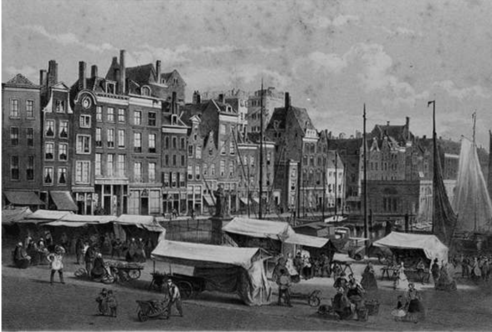
Fig. 3: The Grotemarkt Retrieved from Collectie Stadsarchief Rotterdam. Nr: RI-336

The commodity market was located on the Botersloot up until 1904. The market then moved to the Goudsesingel with an estimate of about 1200 stalls ('Market on the Binnenrotte', 2015). As seen in fig. 4 the market stands of the Goudsesingel market were constructed into rows, creating a lane for the consumer to walk through. The organization of the market slowly started mimicking aspects of a building with lanes that resemble a hallway.