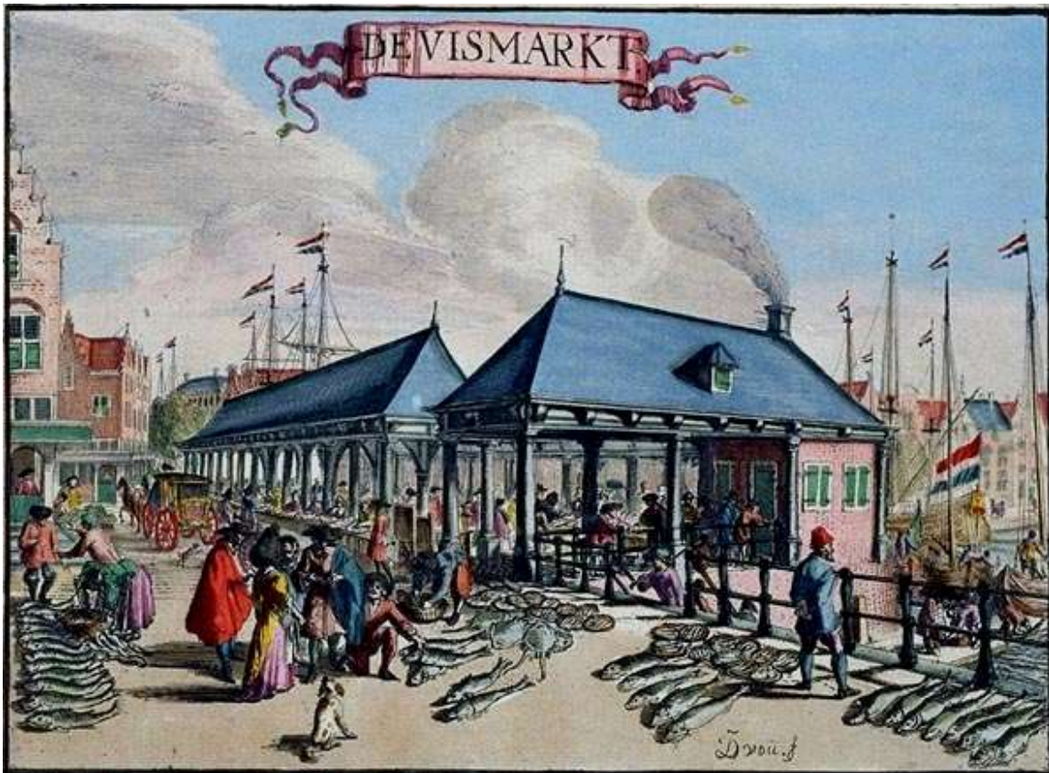
Fig. 1: The fish market Illustration retrieved from Collectie Stadsarchief Rotterdam. Nr: XIV-54

The beginning of the seventeenth century brought new ports to Rotterdam. The city grew into an important trading place for agricultural products and wool. Farmers, fishermen and tradesmen would bring their merchandise to the city via the water. The city was filled with trading ports like in fig. 1, which were named after the product that was traded (van Ravesteyn, 1933, pp. 7-9). The fish market is one of the oldest documented trading ports of Rotterdam which seems to be a place where traders would sell their fish from off the floor.