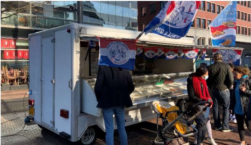
Fig. 16: The fish sales vehicle

Nowadays, the markets also rely on sales vehicles like food trucks partly for hygienic reasons. The admission of food sale is a necessary condition to be approved on. The structures provided by the council are less hygienic in the sense that they are constantly being touched, changed and transported by various people (Blom, 2009). The food vehicle is a structure in which its layout can be designed for food storage and display. A sales vehicle can also provide electricity which brings the ability to have cooling for the food. As you can see in fig. 16 the front part of the food truck that holds and display the fish, is also a cooling facility.