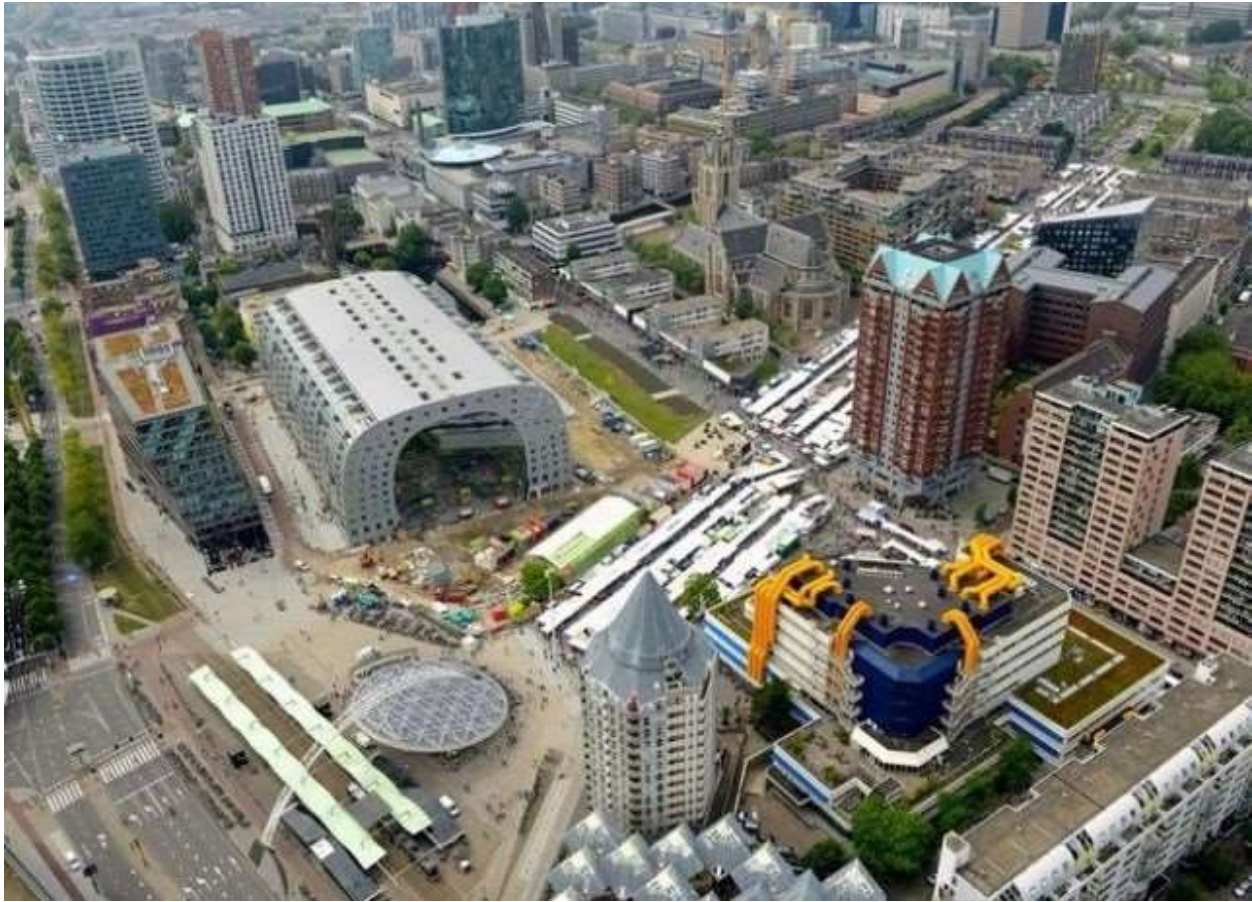
Fig. 15: The Binnenrotte market and its urban context