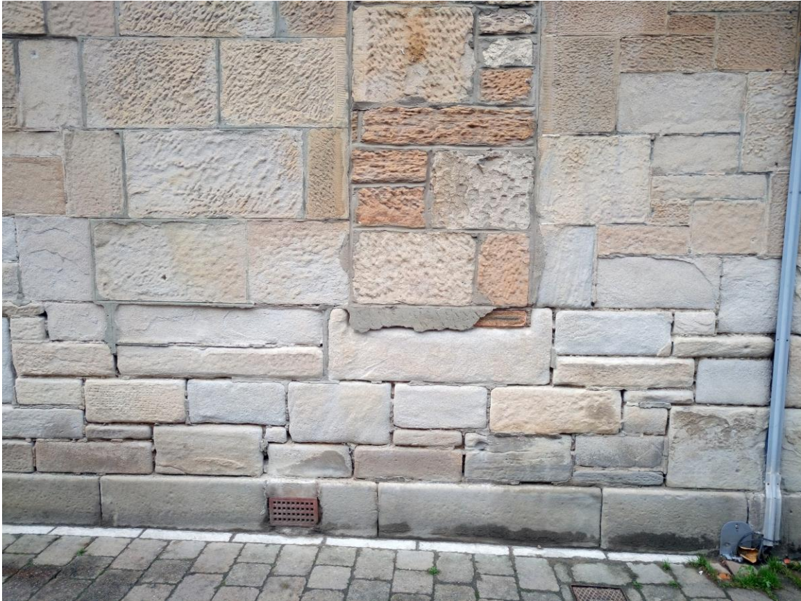
Figure 1: Advanced deterioration of a 19 th century sandstone ashlar masonry façade in Bearsden, Scotland.