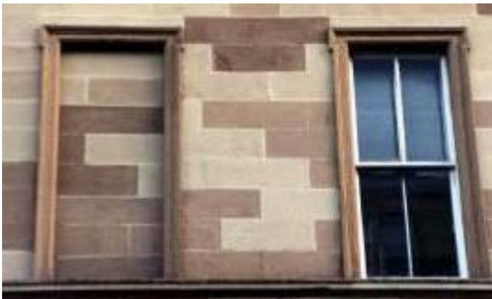
Figure 2: Example of mortar application (light parts) as a mortar repair of deteriorated stone units in Glasgow, Scotland.