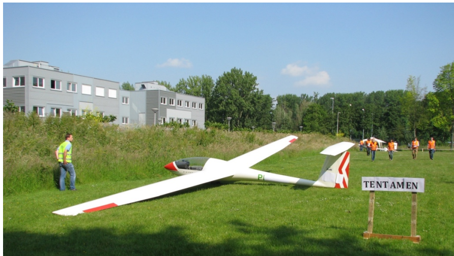
Fig. 1. Set up of Aviation Incident For Exam

Investigator from the Dutch Safety Board who was appointed as assistant professor to increase the links with standard working practice. As such the course was revamped and many principles of active learning and CDIO [2] were applied in the course design. In particular, attention is given to additional required skills such as working in teams, and Critical Thinking skills, Interviewing skills, and Investigative/observation skills. These were specifically added to the Forensic Engineering learning objectives. The students are taken through the whole process of an air accident investigation. During the lectures these skills are practiced and at the end the course this cumulates in an exam which consists of carrying out a (simulated with role-play) aviation accident investigation (see figure 1). A full description of the course, its learning objectives and outcomes have been previously published in a paper at the American Institute for Aeronautics and Astronautics [3].