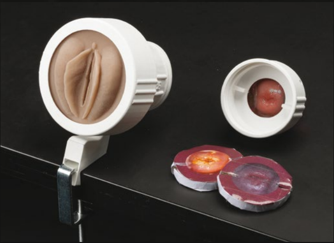
Cervical cancer screening

Juliet Samira Schutten March 2025 Integrated Product Design