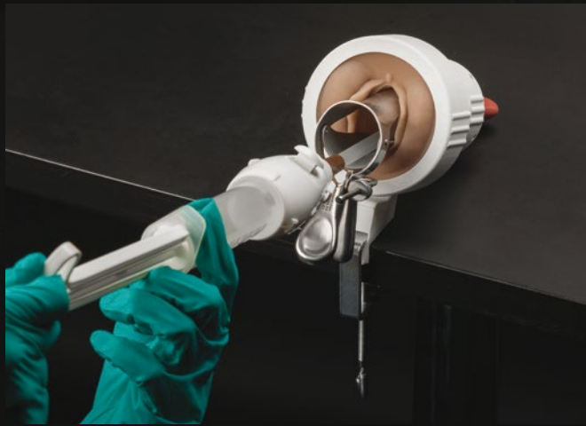
Manual vacuum aspiration