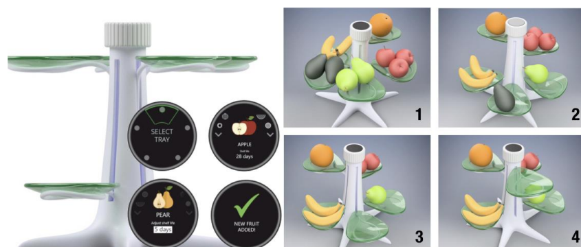
Figure 2. Left side: Prototype outline and the user interface; Right side: Interaction flow

In the second part, all participants were presented with a scenario of them arriving at home with purchased fruits to store. To be specific, the users were invited to navigate in a kitchen scenario (in the first-person view) and to interact with the virtual prototype. The interaction session consists of several steps: placing fruits on the leaf-trays; selecting the branch and fruit category by interacting with the user interface; setting the expected time of consumption according to the suggested life span. Upon the placement of the set-up, the fruit starts moving down along the tree trunk. Finally, an empty tray will return to its top position (The interaction flow of the prototype is shown on the right side of Figure 2).