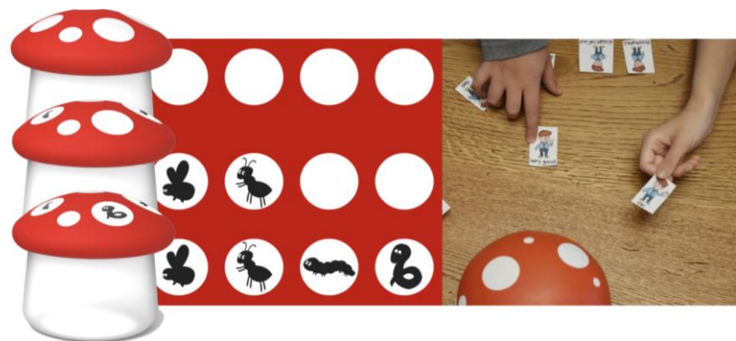
Figure 3. Left side: Design of the metaphorical feedbacks; Right side: User test

A working prototype was developed by using the Arduino Uno board ( www.arduino.cc ) in connection with an application developed by using the Unity3D game engine ( www.unity3d.com ). The connection is realised via a Bluetooth HC-06 module, which allows direct control from the application to the container. The developed board can convert the received values as inputs to the timer. After the user presses the lid, a button will be initiated to start the timer, which in turn, will release the light from zero to four LEDs. Projections of animated shadows of four different kinds of animals will then be displayed accordingly on the lid (as shown in the left side of Figure 3). At the same time, audio feedback as a safety reminder is transmitted and delivered through a piezo speaker.