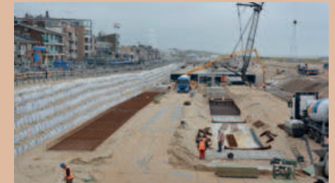
including car traffic tunnel and multi-functional promenade (Image courtesy Google Earth).