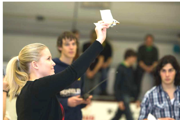
Figure 2 Explorative hands-on learning by conceptualising, designing, manufacturing and testing a flying wing in the first-year design project