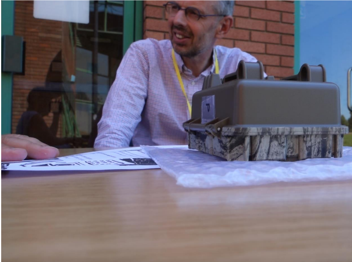
Figure 2 The Pragmatist clearing with a camera (face down, so not filming at that moment) and an instruction card about the perspective [still from a normal video camera]

Two sophisticated wildlife cameras were brought to the situation. Each team explored what this state-of-the-art technology could do for the project. Figure 2 gives an impression of one such camera and a 'clearing': the vantage point of Pragmatism, from which to explore what the camera does and could do. The clearing is a table around which participants were seated, with an instruction card about the perspective. After informed consent of the participants, the moderators used the wildlife cameras to record the design situation parts of the Conversation.