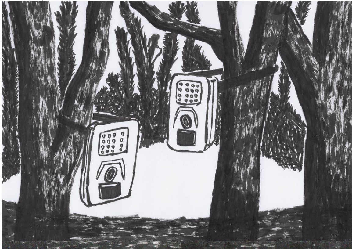
Figure 1 Two wildlife cameras and a clearing

In this Conversation session we explored the two contrasting philosophical perspectives of Pragmatism and Inventivism. Pragmatism tends to focus on technical objects as fulfilling a purpose for mankind in a concrete situational context. In contrast, the French philosopher Gilbert Simondon introduces an Inventivist philosophical position in which technical objects a) have their own mode of being called technicity, b) are becoming more open, and c) should not be reduced to a purpose, as that hinders their co-emergence with mankind - a problematic position with regards to design. The Conversation took the form of exploring an imaginary design case revolving around using the technology of a wildlife camera to design for