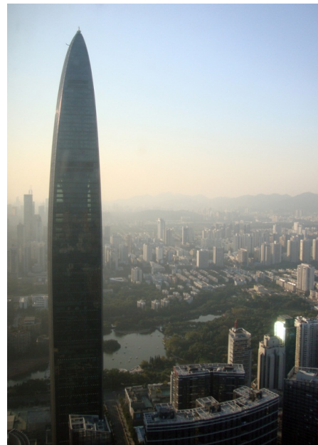
Figure 2: Kingkey 100: redevelopment of the Caiwuwei village.

The match between people's needs and their living environment is a quality of liveability, which is defined as 'fit to live in'. Perceived liveability stands for people's perception to the human settlement. It could be measured by the extent to which the users appreciate their habitat, based upon their daily interaction with the physical and social environment (Gifford, 1997). There is another notion we need to mention- sustainable liveability- that emphasizes on basic needs of people, the same as sustainable development does (UN 1992, 2002), since these basic needs are durable, not only for the present but also for future generations. In this paper, we address these basic needs in relation to the physical environment, which include: 1) health and safety; 2) material prosperity; 3) social relationships; 4) control; 5) contact with the natural environment (Van Dorst, 2010). The importance of these needs is underpinned by theories on behaviour (Maslow 1970; Vroon 1990) and environment-behaviour relationships (Gifford 1997; Bell et al., 2001), with empirical indicators from large-scale and longitudinal research. A primary source is the research on the liveability of nations or the Happiness index (Veenhoven, 1999).