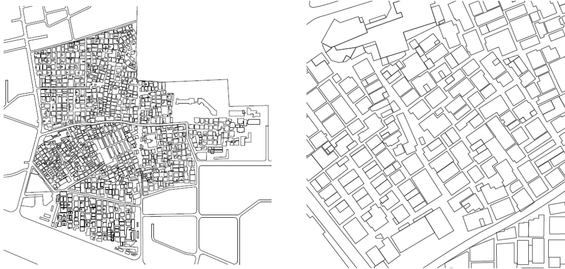
Figure 4: The spatial layout of Baishizhou. Drawing made by Jiping Peng