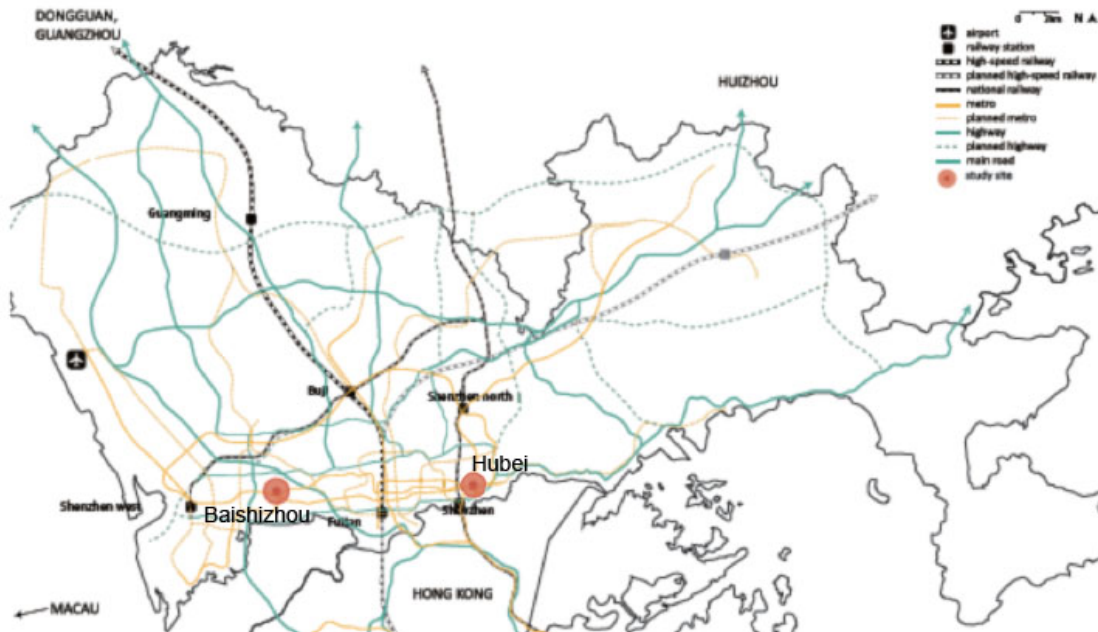
Figure 3: Locations of Baishizhou and Hubei in Shenzhen