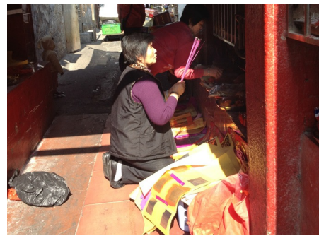
Figure 6: People praying in Hubei village.