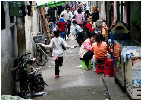
Figure 5: Activities in small alleys in Hubei.