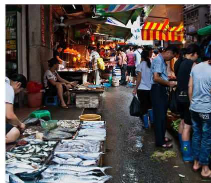
Figure 8: Informal markets in Hubei village.