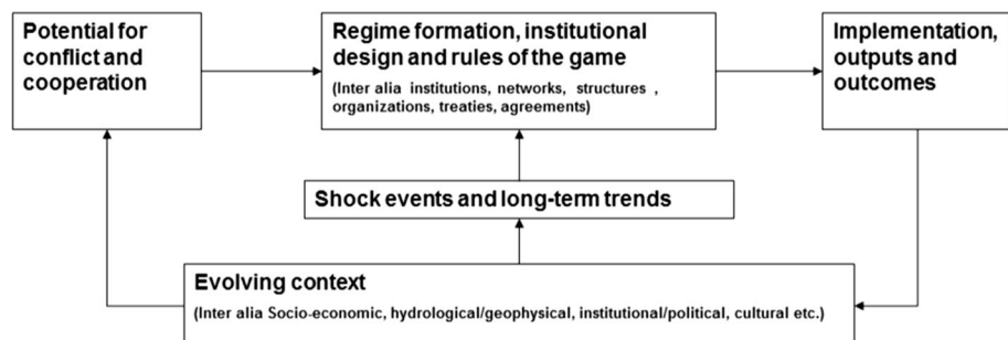
Fig. 1 Transboundary water regimes as a cyclic process, based on Mostert (2005)

Though a useful analytical construct, the concept of a cyclic process and successive stages represents of course a rather idealised notion of cross-border cooperation. In the real world, transboundary water management often takes an altogether different course: riparian countries may not come to the table at all to talk and negotiate. Moreover, once cooperative water regimes are formed, it is certainly not granted that cooperation is effective in terms of environmental problem-solving as international RBOs may become ‘paper tigers’ due to missing mandates or implementation of measures is stymied due to lack of resources (Zeitoun and Mirumachi 2008; Öjendal et al. 2013; Grey et al. 2016). Moving from one