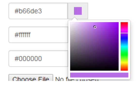
Figure 5: Bootstrap Colorpicker

reusable components. Furthermore, it makes it easy to build a site that can run on multiple screensizes (Computer, Tablet, Phone). It is widely supported and is used by default in MVC5 that uses Razor as its view engine.