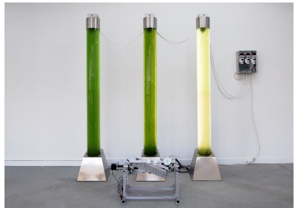
Fig. 5. Space Farming Project, Arthrospira Photobioreactor with Microgravity Simulator.