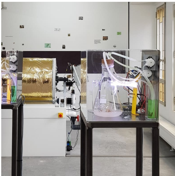
Fig. 3. Space Farming Project, Plant Morphogenerator.