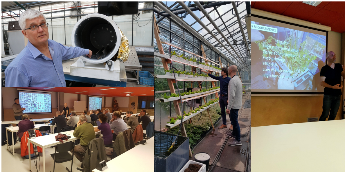
Fig. 1. Space Farming project, project development at Howest and PTI Kortrijk.

art theory and more. This co-creation methodology had been employed before by the SEADS collective, in other community art projects such as Biomodd [9] and Seeker [10]. Before the final presentation at the Tendencies '19 exhibition, all prototypes were tested in order to assure a continuous development of the biological cells and plants during the exhibition.