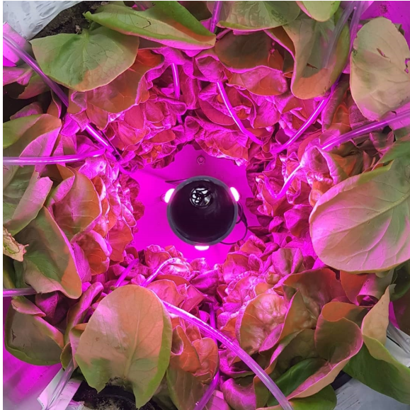
Fig. 2. Space Farming Project, Artificial Gravity Generator. Photo by Gluon.