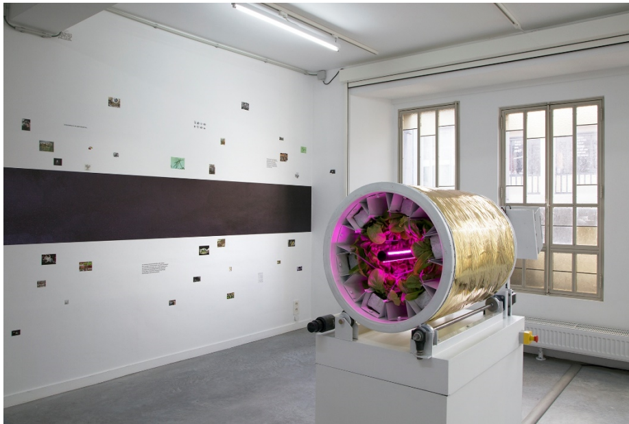
Fig. 7. Space Farming Project, installation view, BOZAR, Brussels, 2019.