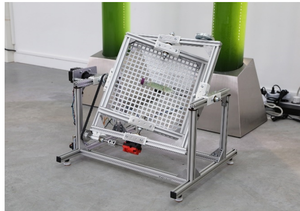
Fig. 6. Space Farming Project, Arthrospira Photobioreactor with Microgravity Simulator (detail).