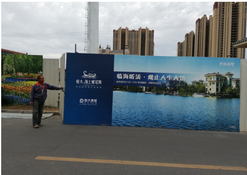
FIG. 17 Billboard of New Venice in Nantong (photo by author, 2018).