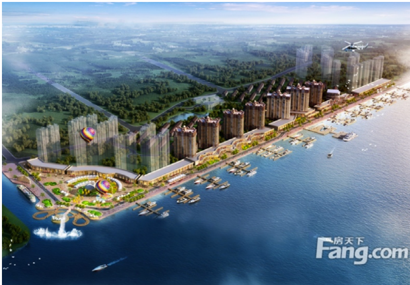
FIG. 13 Fragment of the Long Island development project.