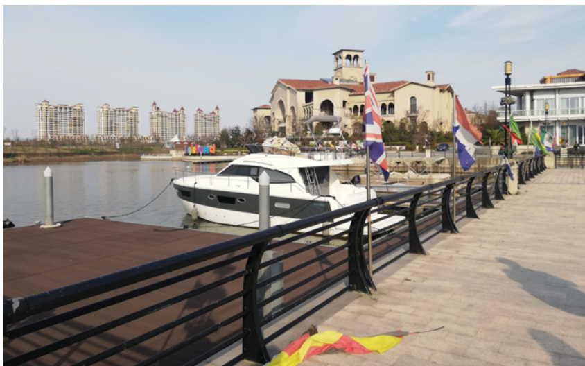
FIG. 15 Empty real estate for investment on Long Island. According to real estate agents and spoken residents almost 100% of the units are owned by Shanghainese (photo by author, 2019).