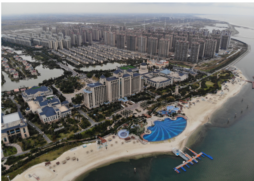
FIG. 18 Privatized new beach in New Venice, Nantong (drone photo by author, 2018).