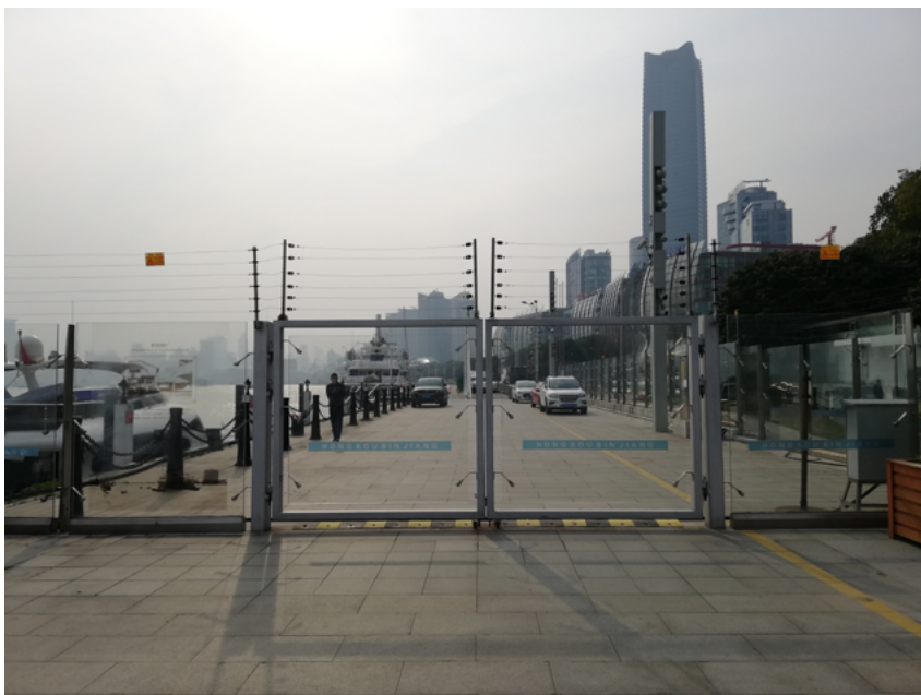
FIG. 11 Figure shows a partly privatized part used for docking luxurious yachts for rent, but seldom used.