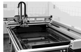
Figure 3: Acoustic instrument placed on a pool (Method 3).

The third method (Method 3) is based on determining the different sediments using acoustic remote sensing, as it is well established that different mean grain sizes result in different received acoustic signals. For this purpose, a novel instrument (Figure 3) was used consisting of a broadband omnidirectional transducer that generates signals with frequencies ranging from 10 kHz to 140 kHz and an array of seven receivers that record waves reflected at nearly normal incidence. The instrument is computer-driven robot designed to ensure accurate positioning in x, y, and z directions and fast scanning.