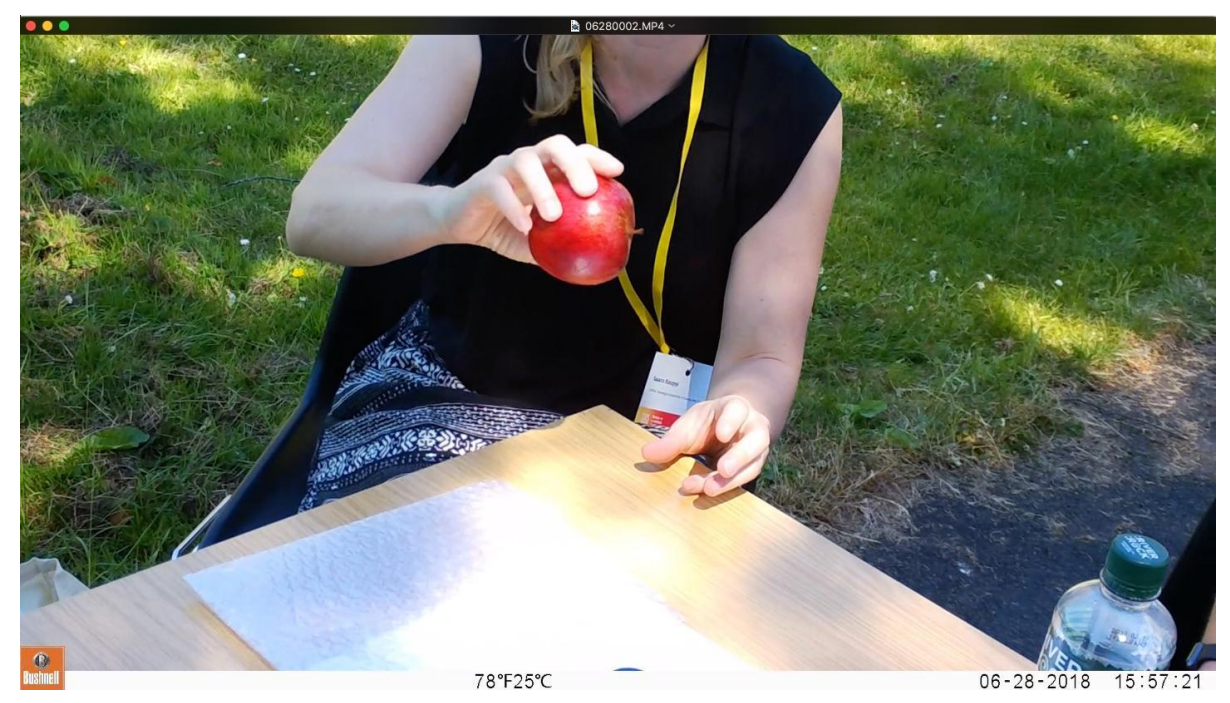
Figure 3 Inventivist clearing participant performing dinner table experience [video still]