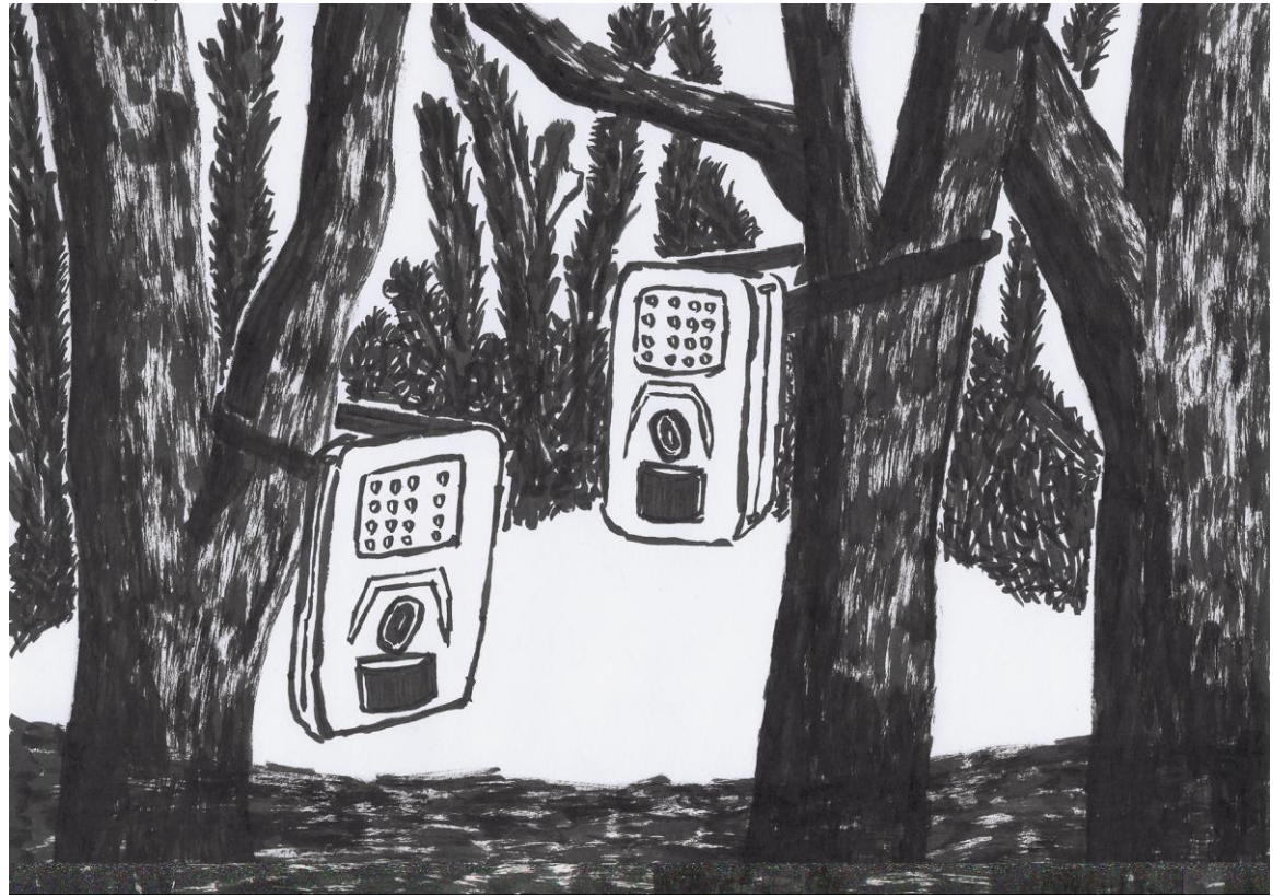
Figure 1 Two wildlife cameras and a clearing

In this Conversation session we explored the two contrasting philosophical perspectives of Pragmatism and Inventivism. Pragmatism tends to focus on technical objects as fulfilling a purpose for mankind in a concrete situational context. In contrast, the French philosopher Gilbert Simondon introduces an Inventivist philosophical position in which technical objects a) have their own mode of being called technicity, b) are becoming more open, and c) should not be reduced to a purpose, as that hinders their co-emergence with mankind - a problematic position with regards to design. The Conversation took the form of exploring an imaginary design case revolving around using the technology of a wildlife camera to design for