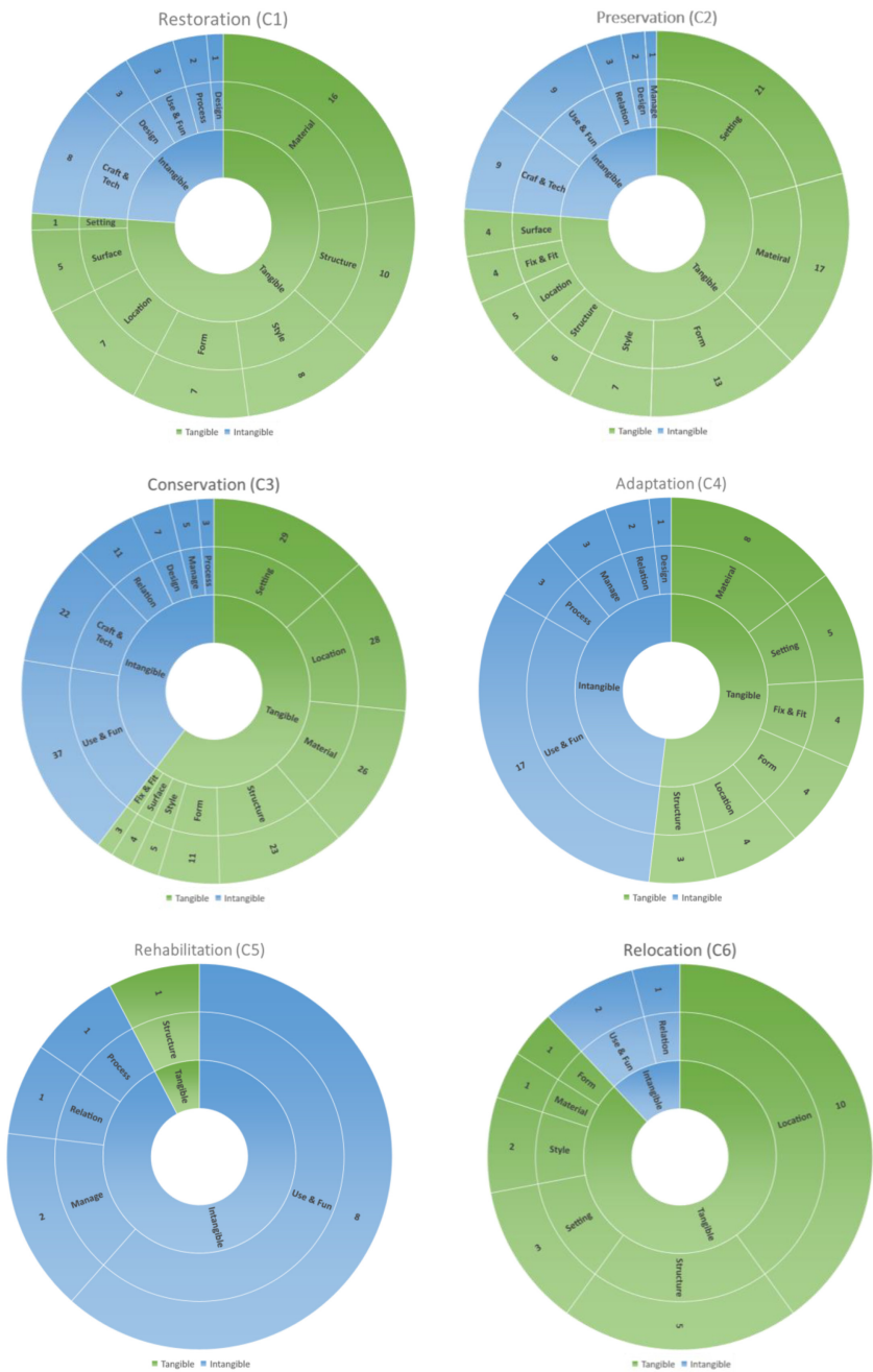
Figure 2. The eight intervention concepts and their proportional references to the fourteen subcategories (tangible and intangible attributes)