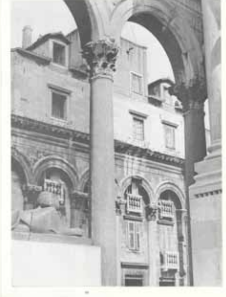
Spread from Forum, no. 2, 1962, special issue on Split, sketches and photos by Jaap Bakema