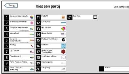
Fig. 1. Example of party screen