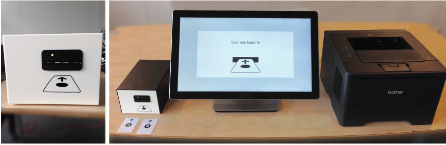
Fig. 3. Simulation of vote-printer hardware configuration; card reader, touch screen, printer

For elderly participants, the independent variable was age. We aimed for a proportional gender distribution (50% male-50% female) with a maximum of 75% of the same gender. The following numbers of subjects per age category were aimed for: