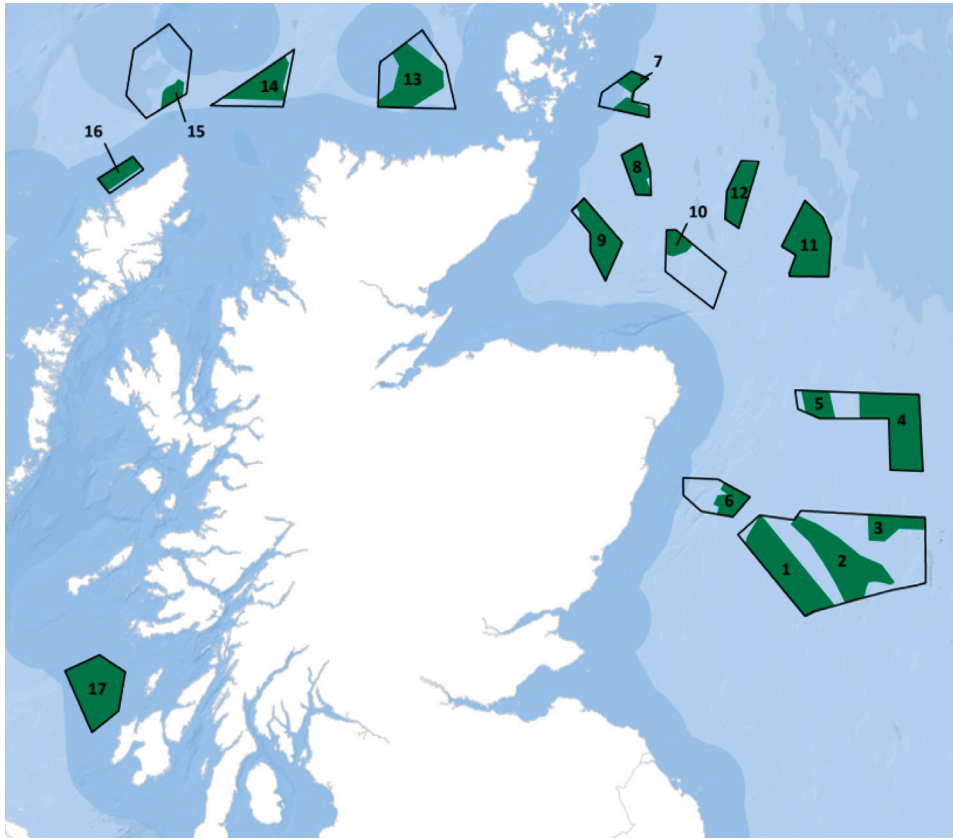
Fig. 3. Recent Scotwind sites up for leasing (Offshore Wind Scotland, 2021).