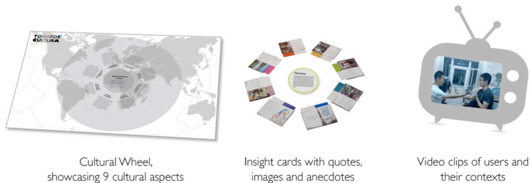
Figure 1. Overview of the tools in the Cultura toolkit (details in Figures 3 and 4)

toolkit includes two sets of data: (1) user data gathered specifically from the target group for the design topic at hand; (2) cultural information selected from theories to contextualize the user data.