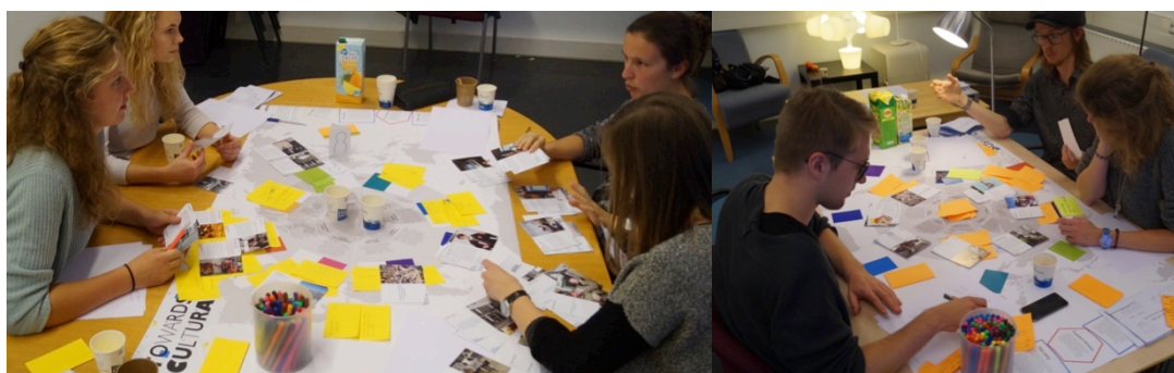
Figure 5. The designers using the toolkit in the design sessions

Cultural wheel provided designers a clear overview of what aspects can be considered when encountering an unknown cultural context. In the evaluation interview, one designer said the cultural wheel 'gives a clear overview'. He added, 'If you have an overview, I think it really helps your design and also speeds up the process, more importantly, coming up with richer ideas.' These aspects also helped the designers to structure, manage, and keep track of user information. As we observed during the sessions, all the designers used this structure to organize their post-its (notes) and to arrange the filtered insight cards (Figure 5). 'It helped us to make connections among all the aspects and based on the connections we develop an understanding about their situation,' explained a designer. Next to that, the designers were asked to reflect on the 9 cultural aspects specifically. Each of the aspects and their related cards were found to contribute to generate an overview of the intended cultural context: 'The connection between those aspects is really interesting for understanding the situations. I don't think an individual category will be enough to gain such understanding. I think we used a lot of connections between those.' This confirmed our confidence in not explicitly providing theory about the connections, but rather evoking them through the format of the toolkit.