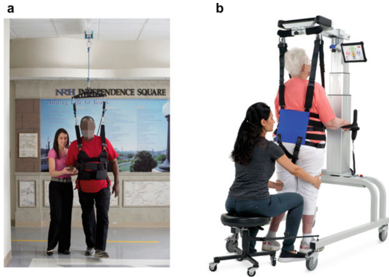
Fig. 33.2 Passive body weight support devices. a Zero-G passive, b LiteGait