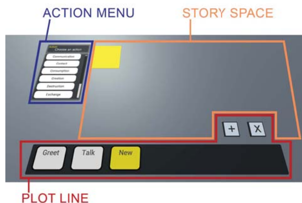
Fig. 1. Overview of the Story ARTist work area and interface

In Story ARTist, a story line consists of a sequence of plot points, each one representing a single action. When a new plot point is created, an action needs to be chosen and the plot point has to be filled with information related to that action. Once