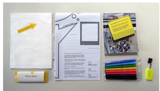
Fig. 2. Overview of cultural probes set. Contents: canvas poster, pictures of exemplary creative spaces, coloured pens, snack with questionnaire inside, USB stick for digital files, and return envelope.

We provided nine selected participants with a canvas-based cultural probes set (see Figs. 2 and 3). We chose the participants to address a wide range of backgrounds and employment positions. We invited four practitioners (one start-up founder, one self-employed designer, and two employees of global companies), one student, and four research associates from different departments. Unfortunately, the future architects of the space were not able to participate in the study. Two of the nine participants had prior experience with working in idea labs but had not been previously involved in any deliberate spatial planning processes.