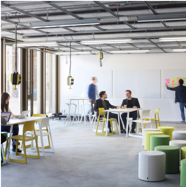
Fig. 6. Final idea lab in use (photo ©Eibe Sönnecken, used with permission from Birk Heilmeyer und Frenzel Architects).