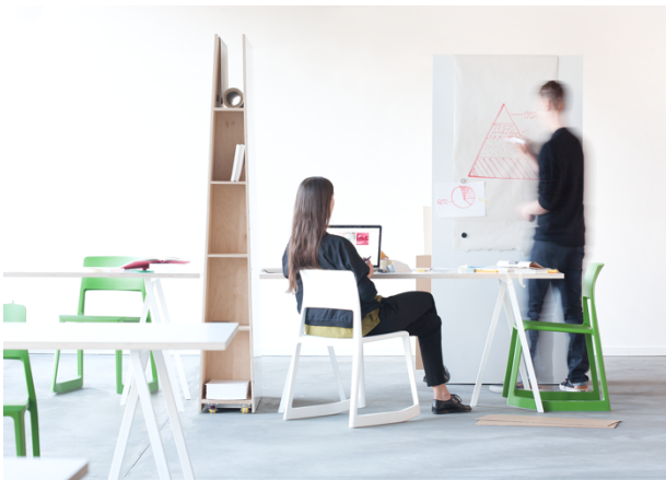
Fig. 7. Final furniture concept: storage-whiteboards.