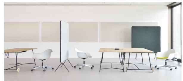
Fig. 5. Final furniture concept: tables and pinboards.

Table 1 outlines our 39 recommendations and indicates which of them have been implemented. Our on-site evaluations revealed that more than half of the recommended specifications had been implemented fully or partially (21 out of 39). Additionally, several measures that have not been implemented directly in the lab are now available in other areas of the complex; for example, video conferencing systems are located in co-working spaces next door. Similarly, lounge areas and games can be found on each floor. Nevertheless, some requirements that the workshop participants emphasized in the planning phase have not been implemented at all. Examples include adjustable light systems, outdoor access (which is possible but leads to a parking lot), and specific equipment (e.g., desktop computers, printers, and prototyping material). Other requirements were implemented as recommended; for example, an individual furniture line was designed through a design contest. Figures 5–7 show impressions of the final idea lab space and the customized furniture concept.