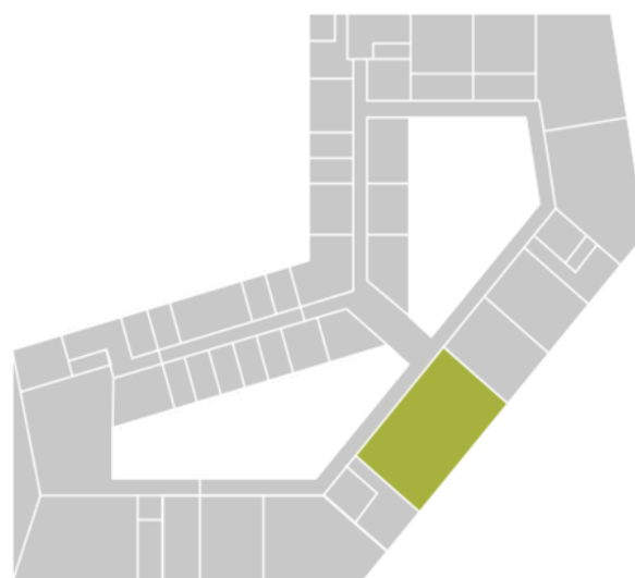
Fig. 1. Floor plan of the building, indicating the location of the idea lab within the innovation centre.