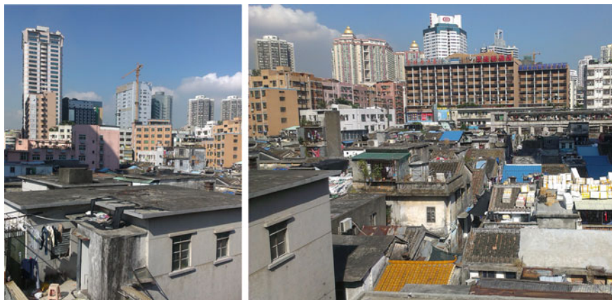
Fig. 14.1 Hubei village in the central urban area, Luohu district, of Shenzhen.