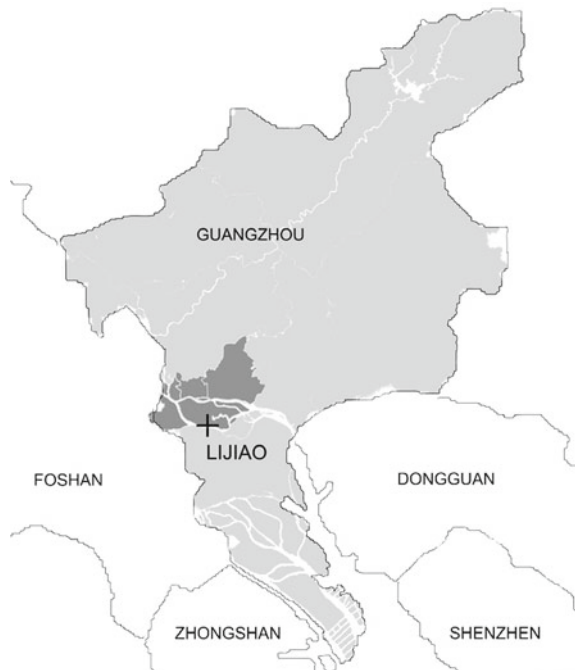
Fig. 14.2 The location of the Lijiao village in Guangzhou. Image Qiao Yang, TU Delft

Along with the decreasing of secondary industries in the overall economic structure of Guangzhou, low-end manufactory industries inside urban villages, such as those collectively owned land for industrial development in the Lijiao village, will be gradually replaced soon. Instead, the emerging industries, like e-commerce, will