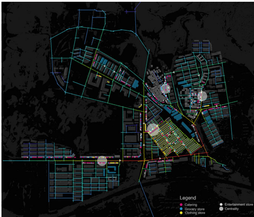
Fig. 14.7 Overlaying the mapping of retail stores and street integration analysis at R = 800 .

Considering the special context of this peripheral district, TU Delft students concluded their research with planning and design principles for urban regeneration