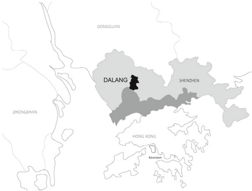
Fig. 14.5 The location of the Dalang district in Shenzhen.