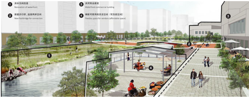
Fig. 14.8 A design proposal for activating waterfront public spaces through new connections in North Dalang. Image Yishiqin Li, TU Delft

in urban villages in Dalang. These include, for example, increasing street integration, prioritising slow traffic as well as the comfort of walking and cycling environment and diversifying public space to facilitate street vendors and other informal activities. The mapping analysis helped to indicate potential areas for intervention. Figure 14.8 shows an example of a design proposal that illustrates how the improvement of (currently abandoned) waterfront area next to an urban village in North Dalang and the new connections through a footbridge can contribute to the integration of street networks and activate public spaces. Based on this, new commercial functions and flexible spaces for vendors are expected to emerge, which will contribute to the inclusiveness and vitality of this area.