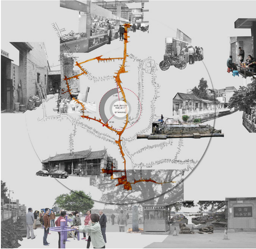
Fig. 14.3 The spatial configuration representing the transformation of the Lijiao village in the past decades. Image Qiao Yang, TU Delft

offer new opportunities for young entrepreneurs who see urban villages as suitable places for investment. For example, in Guangzhou, ‘Taobao villages’ have emerged in urban (and rural) villages along the edge of the central city, with clustered small businesses based on the e-commerce platform called ‘Taobao’ (Zhang et al. 2016). The flexibility embedded in informality in the use of space in urban villages offers people possibilities to be entrepreneurial. Such processes of accumulating wealth and social capital is also a process of climbing the social ladder.