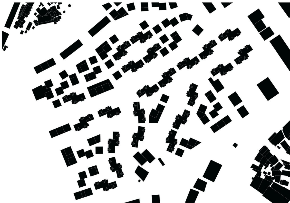
2 Current situation vs. the designed masterplan