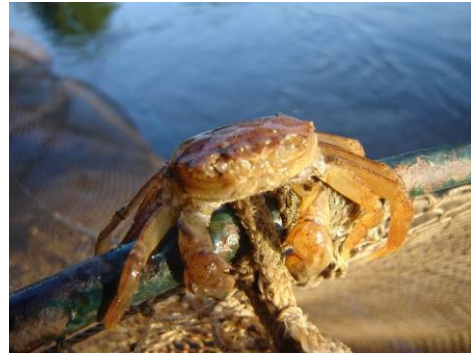
Chinese mitten crab