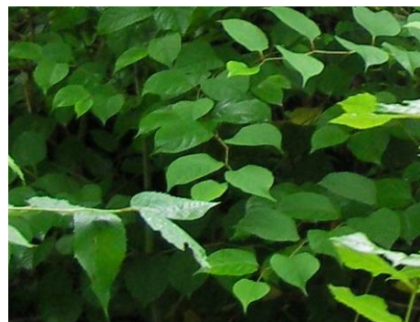
Japanese knotweed (leaves)