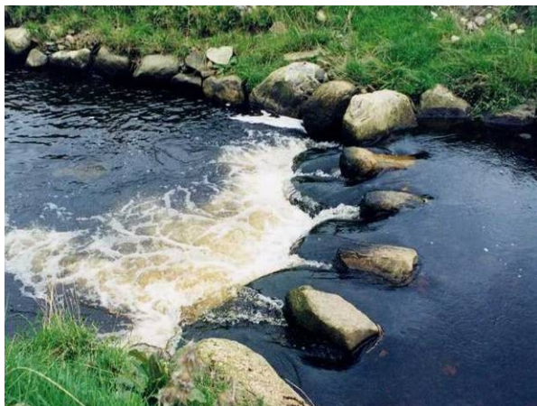
Figure 4.2 In-stream structure – vortex stone weir