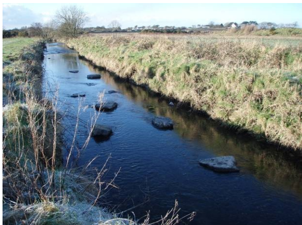
Figure 4.5 In-stream boulders creating hydraulic diversity