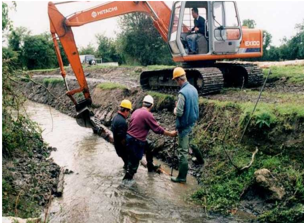
Figure 4.7 Soft-engineered bank restoration

Log revetment and Christmas trees to trap silt.