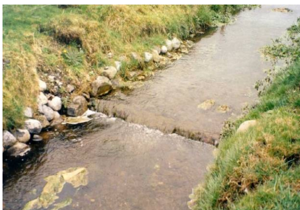
Figure 4.3 In-stream structure – a log 'notch' weir

Must ensure that stones remain in place during flood flows. A stone apron is required in a channel with steeper gradients and high energy flows. Vortex rocks should rest on layer of footer rocks with top elevation at existing bed level. Rock elevation at the centre of the weir should be at or near bed level to permit fish passage at low flows.