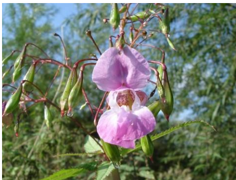
Himalayan balsam (flower)