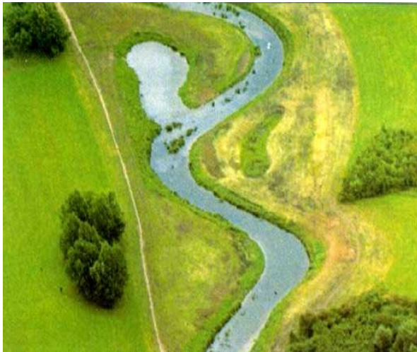
Figure 4.9 Permanently connected backwater

Lateral connectivity can be engineered in this formal way by constructing backwaters with active connections to the watercourse or by allowing a degree of naturalisation to occur via intervention. Such intervention can be as simple as blocking drainage ditches or land drains, and allowing wetlands to regenerate within designated areas of the catchment. These areas are purported to act as hydraulic sponges while allowing substantial biodiversity benefits and extremely effective carbon sequestration.