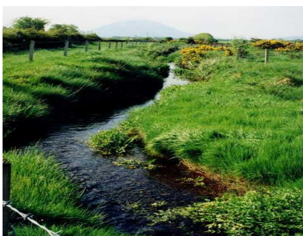
Figure 4.6 Bank protection

Too many boulders can increase erosion within local sections of the channel. Careful thought is required before placement.