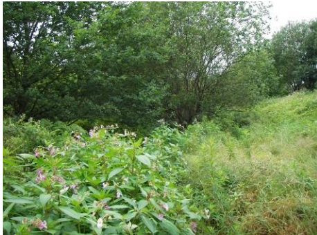
Himalayan balsam (with characteristic pink flowers)