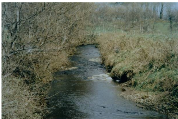
Figure 4.4 In-stream channel deflectors constricting low flow

Requires sturdy anchoring system to prevent collapse of log weir if undercutting occurs.