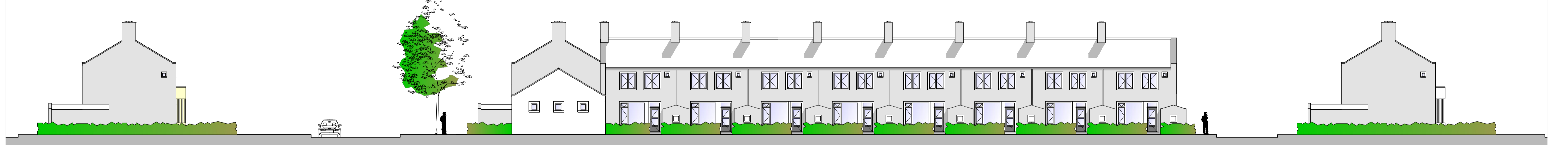
Initial situation 1955