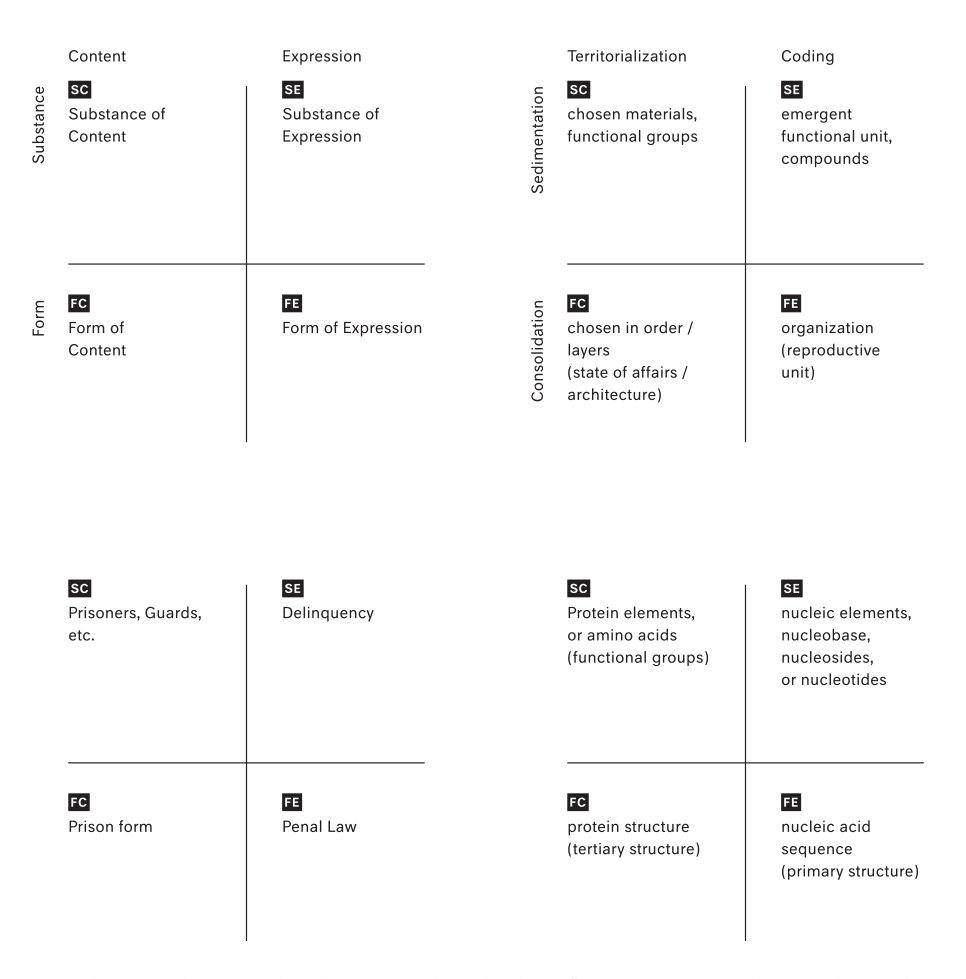
Figure 2. Deleuze and Guattari's adaptation of Hjelmslev's "semiotic net" (redrawn after Deleuze and Guattari, A Thousand Plateaus ), with the double articulation between "substance" and "form," "content" and "expression" (upper left and right). Below, the exemplary "matrices of stratification" of the formation of the Prison (lower left), and of DNA (lower right).

heterogeneous substances (the "form of content"). This assemblage cannot stabilise without a mutual and reciprocal determination, a discursive "coding" of the contents into specific "expressions" (such as Foucault's "sayable"). They equally comprise both a substance and a form, in this case a "form of expression" (here "Penal Law") defining "prisoners" as subjects of a legal code that in return requires a specific "substance of expression," which is their determining "delinquency."