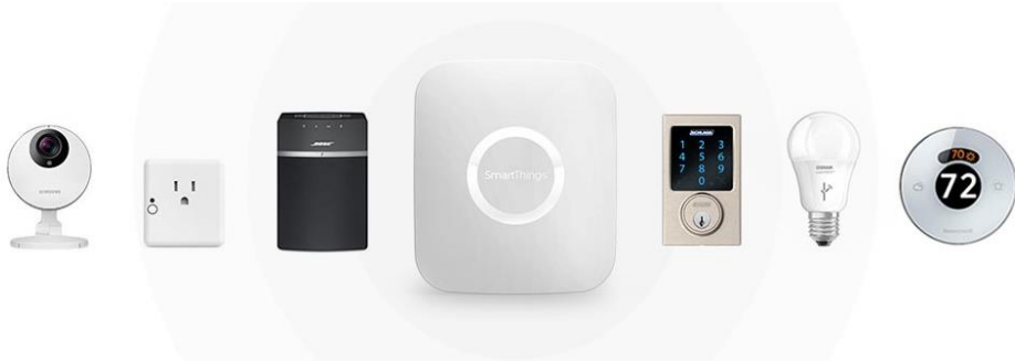
Figure 1. “SmartThings” of Samsung

“SmartThings” of Samsung, which is a smart home system (see figure 1). The smart home system contains a hub and multiple smart devices that are connected to it. The smart devices collect various information about the home, such as energy consumption, the presence of family members, door locks, and entry movement that people can access through an app, allowing them to monitor and control their home from a distance.