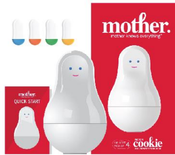
Figure 2. The smart home system: “Mother”

Although product metaphors hold great potential to facilitate consumers’ comprehension of RNPs, current studies have not yet empirically investigated the effects of product metaphors. As designers and design managers are responsible for deciding whether and/or how to use product metaphors to embody RNPs, it is important to equip them with the knowledge of how to make better use of product metaphors to influence consumers’ comprehension of RNPs. This study aims to fill in this gap.