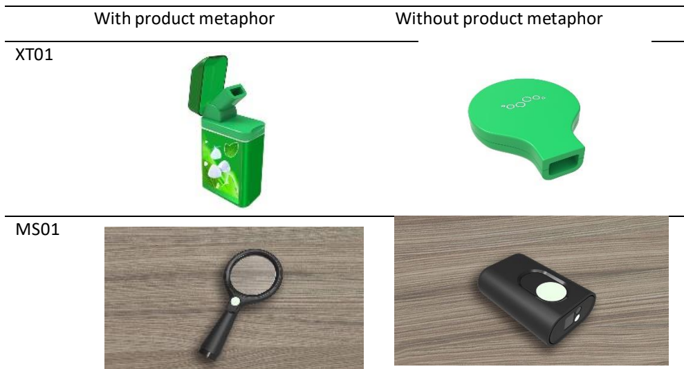
Table 2. Results of design session 2: stimuli for conditions with and without product metaphors for both product categories

Consequently, the design of XT01 and MS01 for the condition with product metaphors resembles a typical mint container and a typical magnifying glass. For the condition of RNPs without product metaphors, the original product appearances were used as stimuli. The brand information was digitally removed. For both conditions, the color and details of product appearances were made as similar as possible. The pictures of RNPs were presented in the same background, size and perspective for both conditions (see table 2).