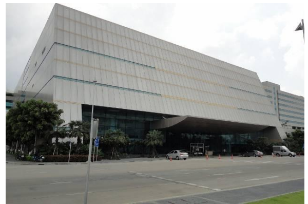
Figure 2 The Dhanarak Asset Development building (left) and The Bangkok Government Complex (right)