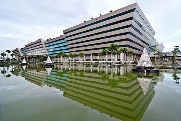
Figure 3 Main hall of the Government Complex buildings (left) and the commercially rented area (right)