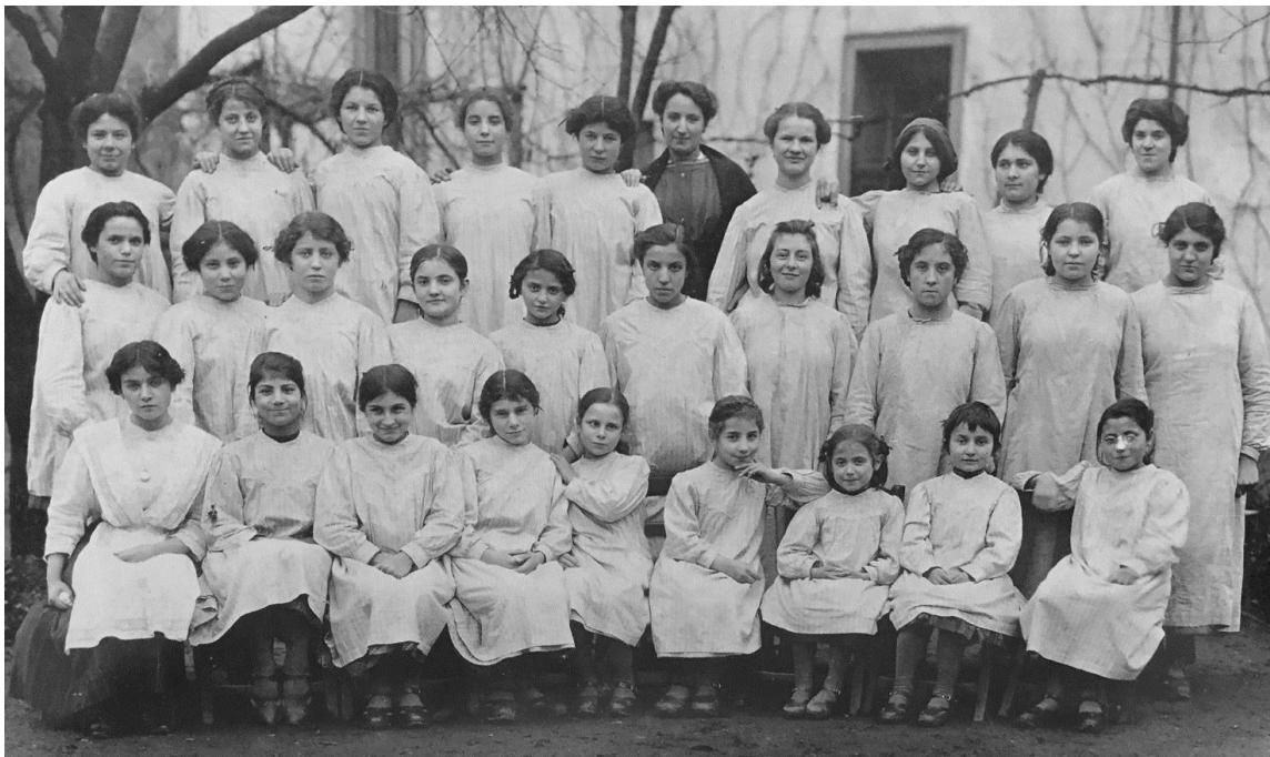
Figure 15: Photography representing the first girls' guests of the Mariuccia Asylum. It is possible to notice that they are all females, very young, some of them had already been victims of trafficking, others were only considered “potential victims”.

Some members of the Committee, including Ersilia Majno Bronzini, had the idea of creating a shelter that could accommodate, without any bureaucratic formality, without distinction of religion or nationality, young girls exposed to the danger of being recruited for sex work. Such as the daughters of prostitutes or prisoners, girls abandoned by their families and without assistance or victims of ill-treatment, violence, incest. In general, all those girls who found themselves living in “morally” and “physically” unhealthy environments and exposed to the risk of being recruited 32 .