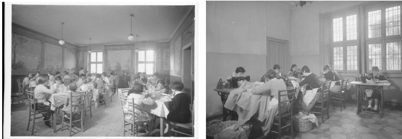
Figure 26: Photo showing the dining room space where young women could eat together and spend their free time.

period. The model promoted was principally the Angel of the House. The girls were expected to be pure, submissive, and nurturing, devoting herself entirely to her husband and children 40 . This model was promoted by the dominant patriarchal society of the time. Especially since the 1930s with the advent of fascism in Italy, which viewed women as inferior and in need of male guidance and protection 41 .