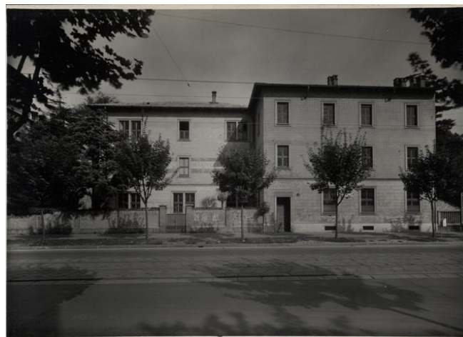
Figure 20 and Figure 21: Pictures showing the Mariuccia Asylum building itself, viale Monterosa 6, in 1902.