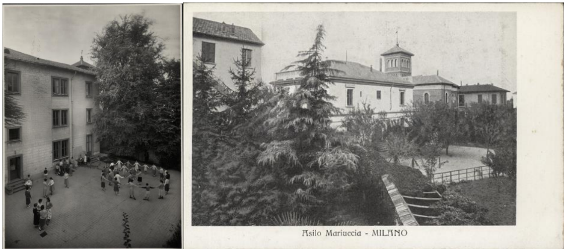
Figure 22: Photo showing the inner courtyard of the building dedicated to the play and recreation of the girls' guests of the Mariuccia Asylum.