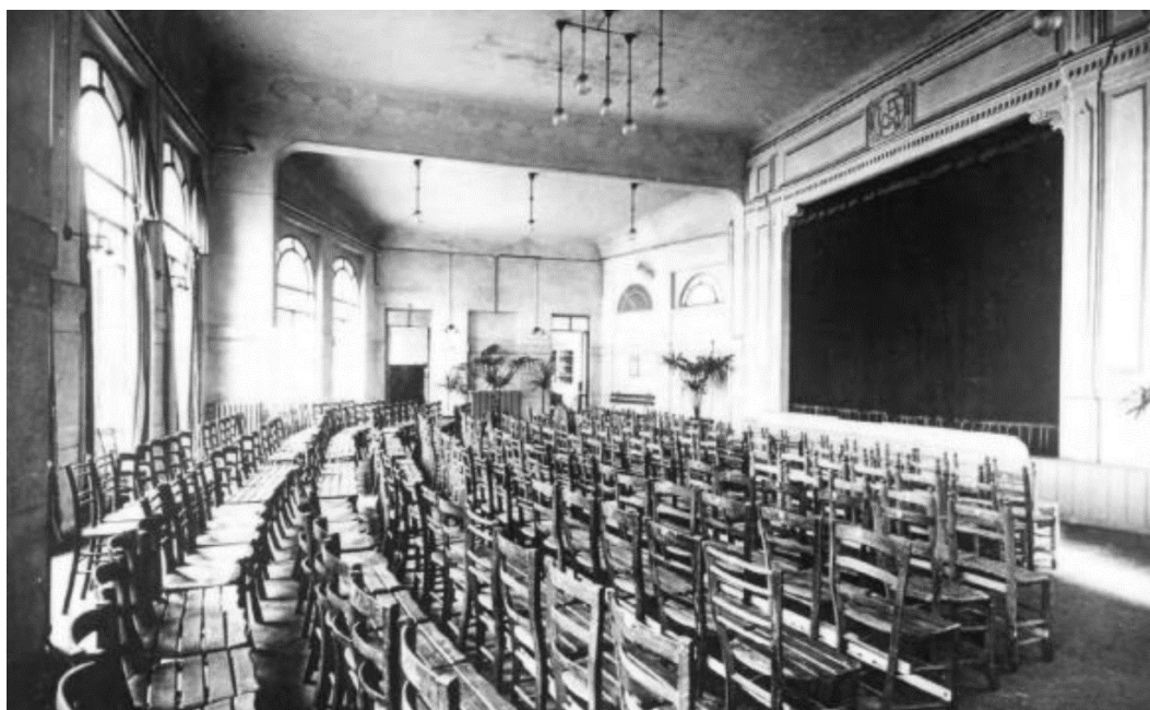
Figure 6: The Union theatre after the First World War.

In addition to the Circle of the Women's Union, the theatre, the library, the house of the Union welcomed the General Association of Mutual Aid for Women Workers in Milan, the Committee against the tratta delle bianche , the trafficking in white women, the administration of the Asilo Mariuccia , Mariuccia Asylum, the Fraternal Society with the Recreation Centre for the swimming pools, the School of Professional Design for Young Women Workers, the Children's Committee, the Employment Office for Maids, the administration of the Information and Assistance Offices, the Society for the Defence of Hygiene of Early Childhood, the Patronage of Minors sentenced conditionally and the Dormitory-Female Pension.