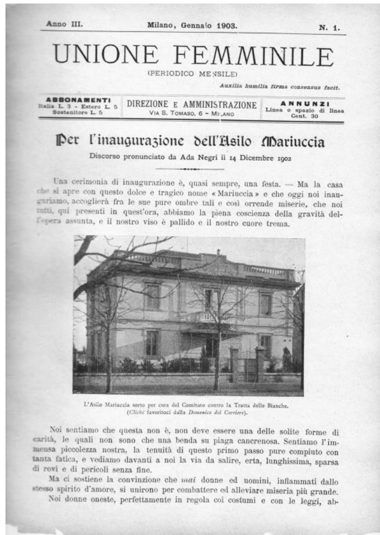
Figure 18: Per l'inaugurazione dell'Asilo Mariuccia , For the inauguration of the Mariuccia Asylum. Scanning of the periodical containing the information relating to the first discussion about women in trafficking. "Unione femminile" of 1903, n.1, 1.

Ersilia and Luigi Majno, who died suddenly of diphtheria in June 1902 at the age of 13. The inauguration ceremony was simple but solemn with a speech by Ada Negri, a close friend of the Majno Family, who underlined that the Mariuccia Asylum was only "the foundation stone of a work of regeneration, far away and different from the ancient manifestations of superficial charity" 36 .