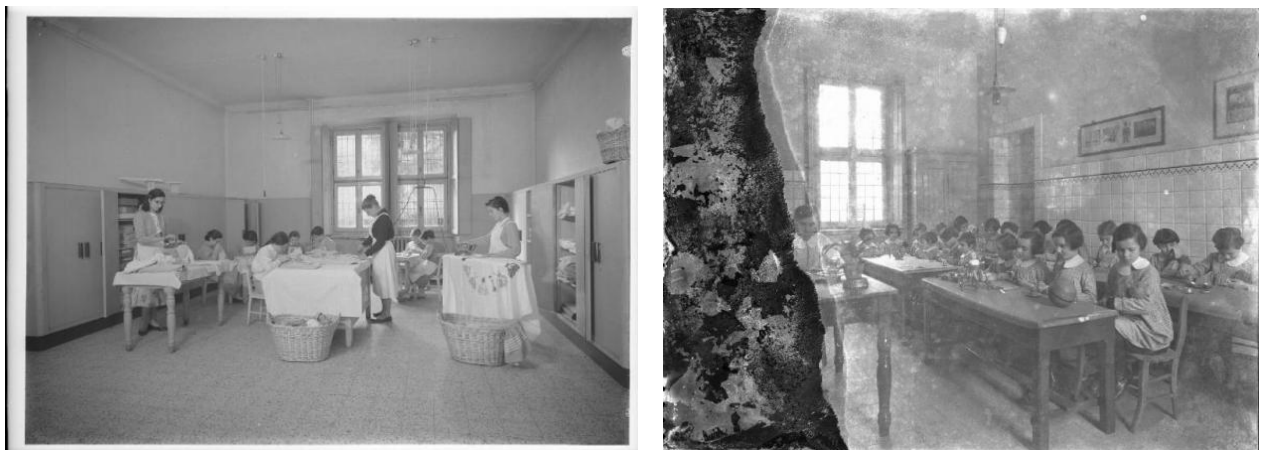
Figure 24 and 25: Images that portray the spaces of the Mariuccia Asylum where girls were made practical workshops and taught domestic work.

At the end of 1916, the Asylum stretched over a large three-story building consisting of two bodies joined by a vast hall erected on a part of the garden. Thus expanded, the Asylum could have rooms for 90 or 100 girls, adequate toilets including hot water showers, large work and study rooms, a recreation room, kitchen, wardrobe, laundry, and ironing, both for your own needs, both as laboratories for teaching domestic work 39 .