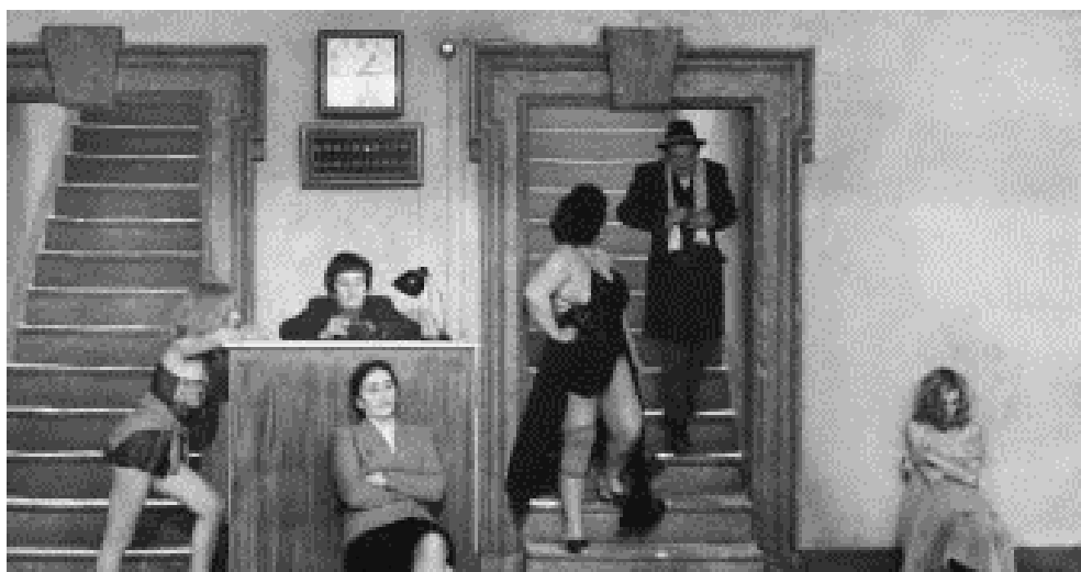
Figure 11: Photography of the most famous brothel in Milan, in the photograph you can also see the madam behind a desk that directs appointments.

Interestingly, every activity had precise rules that girls had to follow. At number 3 of the same street there was a casa chiusa , closed house, where it was forbidden to attract customers, at number 5 women danced and were uninhibited in costumes, with skirts open at the front to show the legs. The clothes had to be showy and provocative, but also easy to take off. Each house then aimed at a different audience: the young were easily lured by the provocative dancers of the number 5, while the men more confident preferred the shy and submissive women of the number 3 23 .