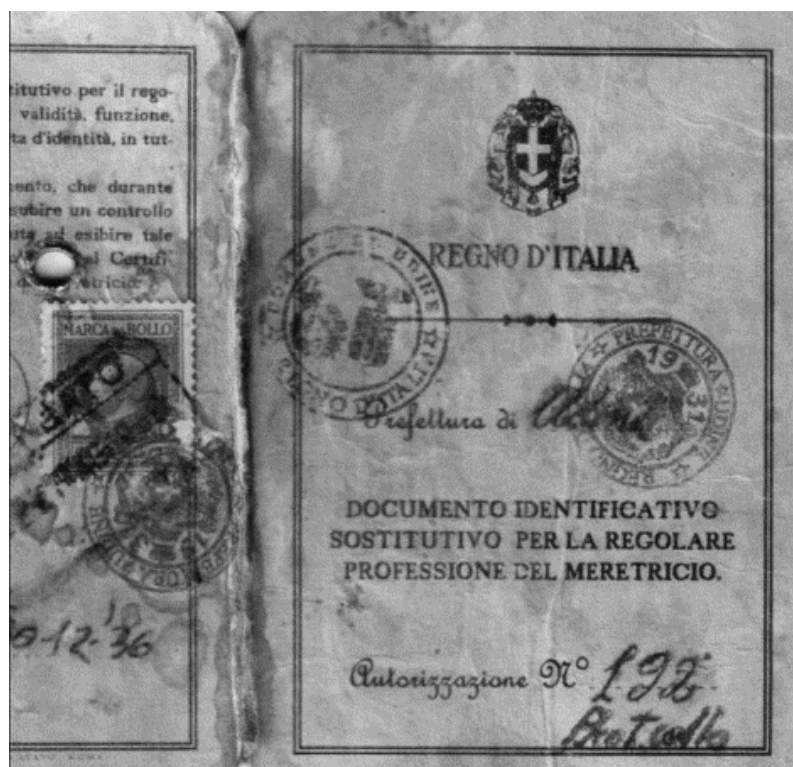
Figure 8: Documento identificativo sostitutivo per la regolare professione del meretricio , Identification document for the regular profession of meretricium. Identification document that prostitutes were obliged to have.

appuntamenti , literally houses for appointments: where men could go to meet prostitutes, and at least 335,817 sex workers, placing Milan between cities with the highest numbers 20 .