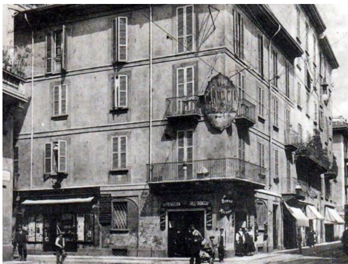
Figure 10: Photography showing the building in one of the vicoli del piacere , alleys of pleasure in Milan, in Via Fiori Chiari. Source: Brera Design District website, 1900.

Interestingly, every activity had precise rules that girls had to follow. At number 3 of the same street there was a casa chiusa , closed house, where it was forbidden to attract customers, at number 5 women danced and were uninhibited in costumes, with skirts open at the front to show the legs. The clothes had to be showy and provocative, but also easy to take off. Each house then aimed at a different audience: the young were easily lured by the provocative dancers of the number 5, while the men more confident preferred the shy and submissive women of the number 3 23 .