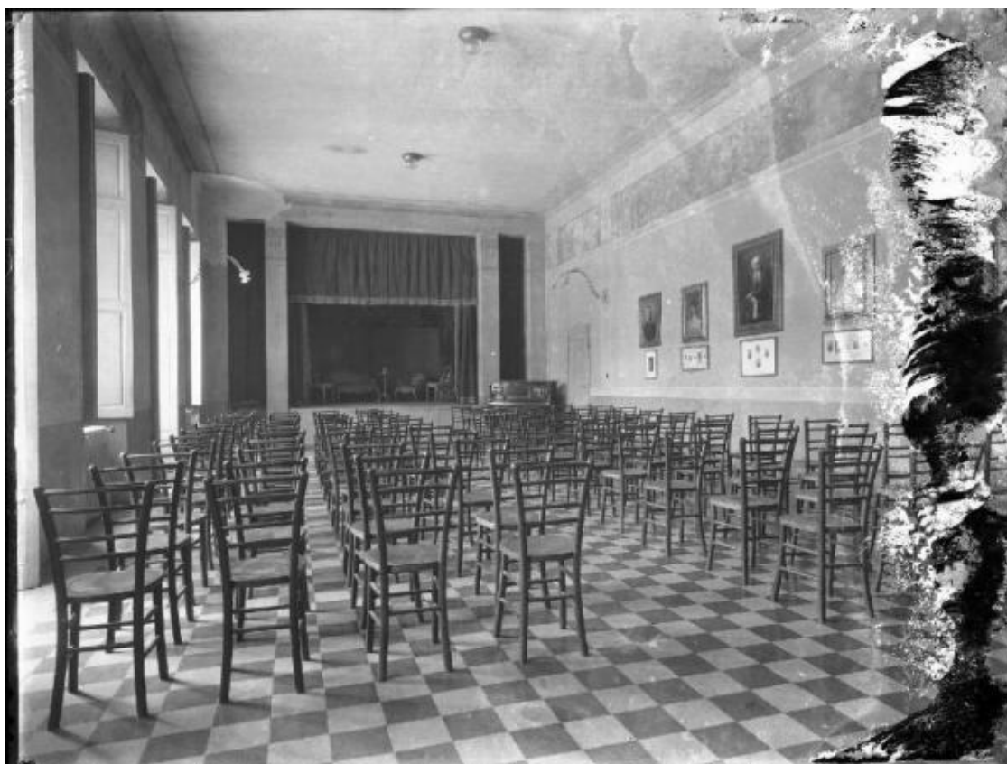
Figure 17: Archive image showing the conference room of the Mariuccia Asylum, where girls could follow debates on the question of women.

The hospitalization services did not end with the guarantee of a seat at the table in the refectory and a bed in the dormitory, but also included a specific clothing, a rich and varied diet and, above all, an image «of good, order, cleanliness [which] must destroy in the unfortunate even the memory of the ignoble, dirty environments where their miserable life took place». Hosting and feeding the girls was not enough, according to the Committee, it was necessary to make them independent both economically and culturally.