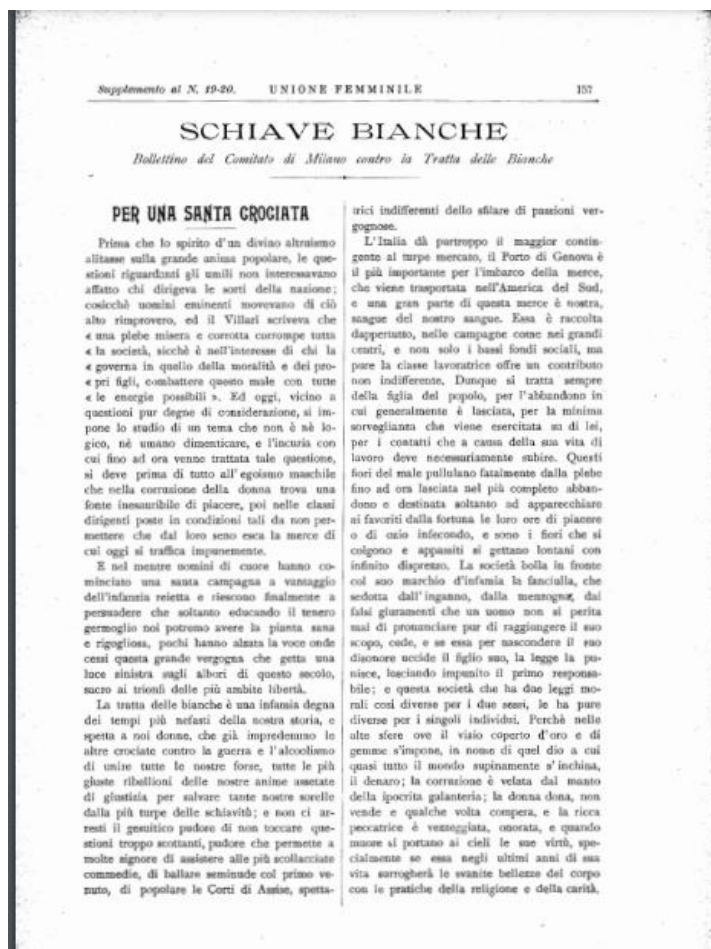
Figure 7: Schiave Bianche, per una santa crociata , White slaves, for a holy crusade. Scanning of the periodical containing the information relating to the first discussion about women in trafficking. "Unione femminile" of 1910, n.4, 169-170.

Although founded in 1900, the Committee has its origins in the movement of opinion, animated by men and women of the city of Milan engaged in social assistance, which shared the adversity against the Cavour Law that allowed the legalization and regulation of sex work in 1861. The Milanese politician Camillo Benso di Cavour established the law of the so-called case di tolleranza , houses of tolerance 18 , thus legalizing for the first time in Italian history sex work in specific places, such as houses and brothels 19 , that offered sexual services under government-appointed compensation. Starting from 1891, compulsory periodic medical examinations for sex workers were made, and, for this purpose, they created a census throughout the national territory. In 1900 it turned out that there were 5,780 case di