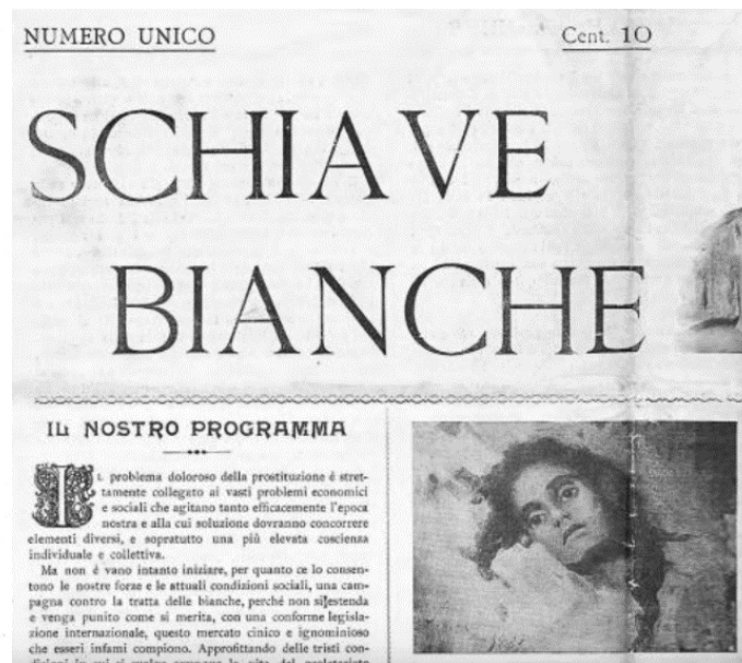
Figure 12: Schiave Bianche , white slaves. "Women's Union" which explains the Committee's work about trafficking in women. Source: "Unione femminile", 1902, n. 23-24, 189 - 196