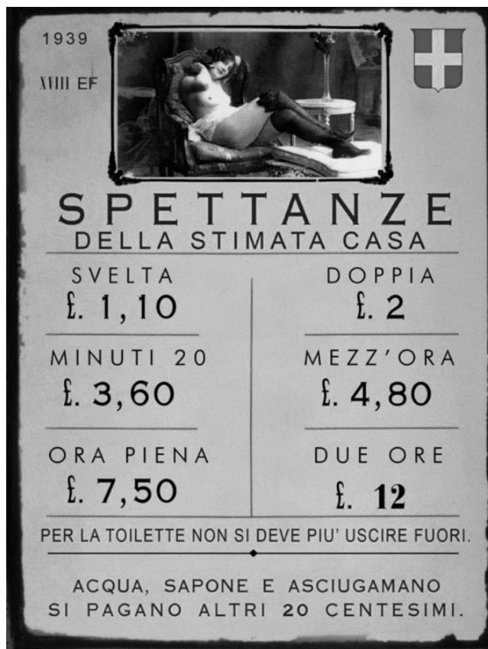
Figure 9: Spettanze della stimata casa , Claims of the esteemed house. Plaque at the entrance of one of the brothels of the city with indicated prices of each performance and times. During the fascist regime, 1939.

One of the places in the city that still today is known for its ten-year history is placed in one of the so-called vicoli del piacere , alleys of pleasure. In via Fiori Chiari 17 stood the brothel of the highest class of Milan of a time, no longer accessible to the public, was one of the most luxurious and well-known houses. In the atrium, there was a staircase in art nouveau style, while the bedrooms, complete with sink, bidet, soaps, cologne, and linen towels (with extra payments), were located on the first floor. The shutters had to remain strictly closed: it is said that the presence of women disturbed the employees who worked in the building opposite.