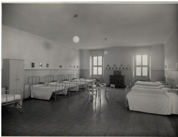
Figure 28: Photo of the interior space of the Porto Valtravaglia office transformed after 1972 into medical-psycho-pedagogical institute.

In 1986, Mariuccia Asylum acquired the library of the UIPE, which was based in Geneva 43 . 4000 works, especially in French and English, that encloses the history of the problems related to children over twenty years in the world: studies, projects, reports, statistics, and debates on children published between the late fifties and early eighties of the twentieth century. The documentary material has been aggregated to the documentation owned by the Mariuccia Asylum consisting of a historical archive relating to the activity of the institution and a library specialized in the history of the family, childhood, and childcare of the twentieth century 44 .