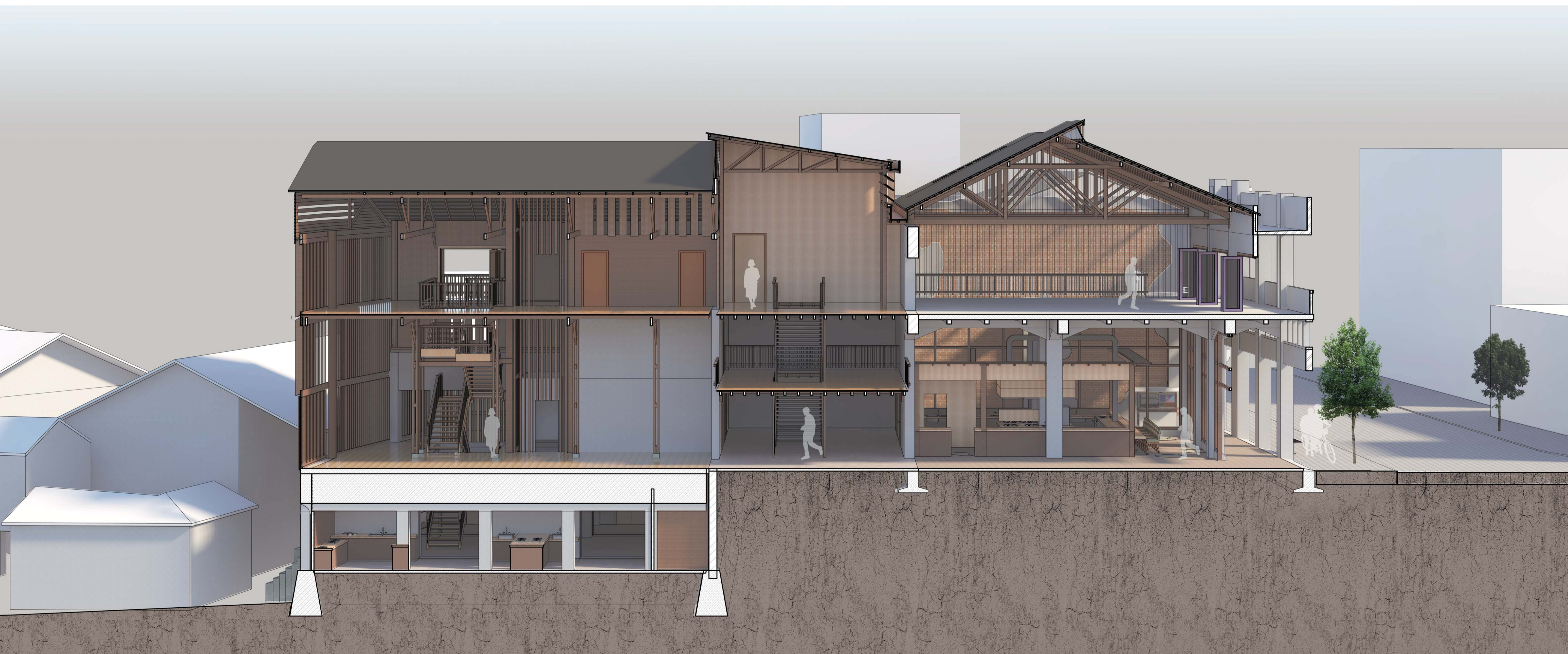
Longitudinal Section: Reinterpretation