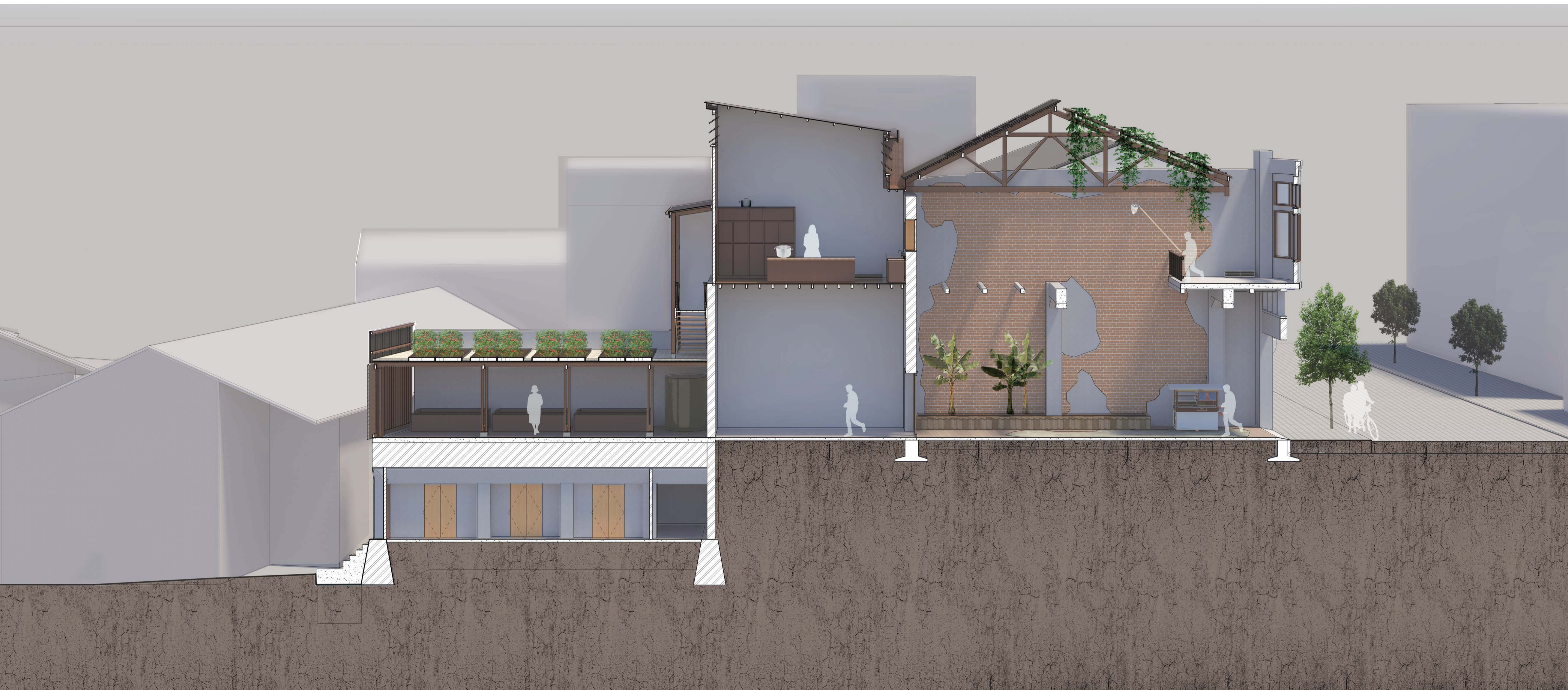
Longitudinal Section: Adaptation