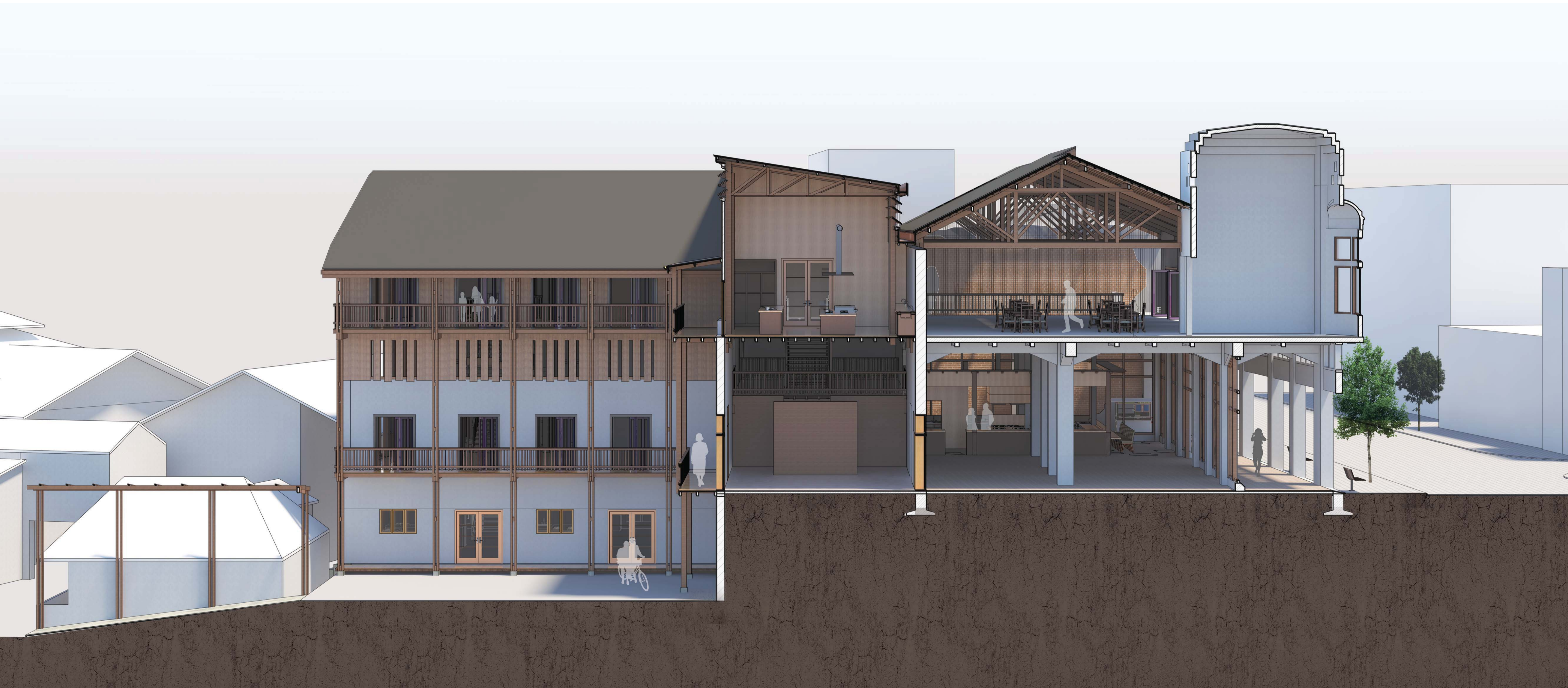
Longitudinal Section: Reconstruction