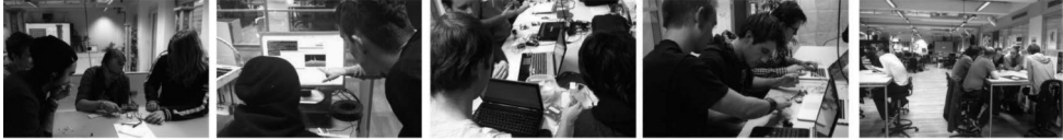
Figure 1. Peer learning during the course FabLab

Moreover, as we consider peer learning an essential part for creating a community in the lab, students are encouraged to brainstorm together and to evaluate each other's work. This way students not only learnt from their own work and mistakes but also from their peers'.