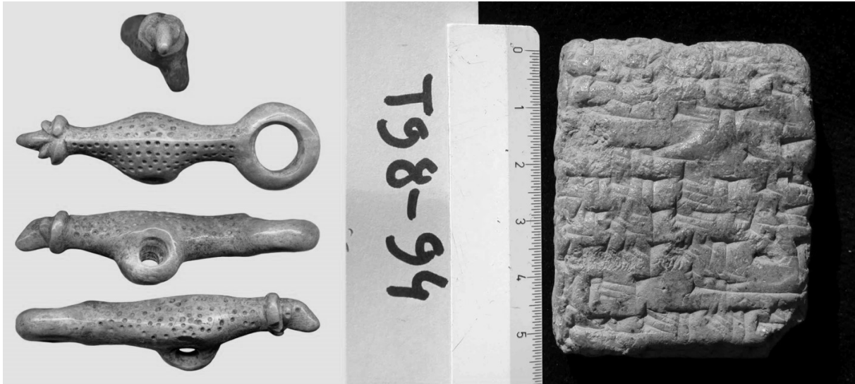
Figure 2. Objects stolen from the Raqqa Central Bank collection. Left, bone buckle (Tell Sabi Abyad, ca. 6500 BC). Right, clay tablet carrying cuneiform text (Tell Sabi Abyad, 1200 BC).