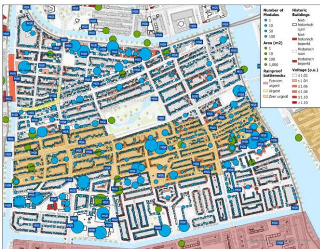
Fig. 3. Geospatial multi-layer map consisting of the PV potential, green roof area, water management bottlenecks, historic buildings and voltage problems.

Finally, several maps such as the ones shown in Figures 1 and 2 can be overlaid to obtain a comprehensive multi-layer map, as shown in Figure 3. It contains several layers of information, interaction and effects between map layers can be detected easily. This enables municipality decision makers for example to get an overview about all the relevant housing information that could be limiting the penetration of PV modules in the investigated area.