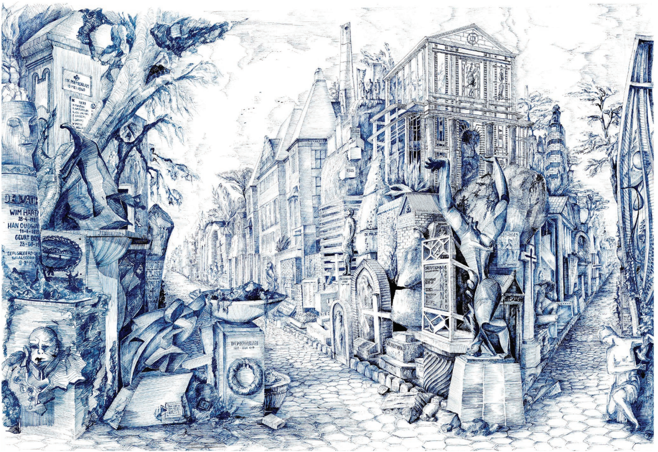
Detail of the First Act: A Memorial for a Memory, for those who still believe in heavy things that are difficult to move