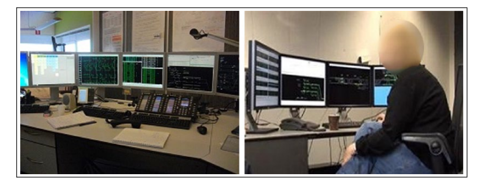
Figure 2. The image on the left shows the reference system, the image on the right shows the gaming simulation (we made the train traffic controller anonymous).

needed to become acquainted with the new infrastructure and to the new basic rush hour timetabling.