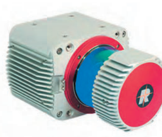
▲ Examples of small, lightweight Lidar sensors: South's Lidar SZT-V100, weight 1.5kg (left); Teledyne Optech's CL-360 OEM Lidar sensor released in 2019, weight 3.5kg (middle); the RIEGL VUX-1UAV, weight 3.5kg (right).