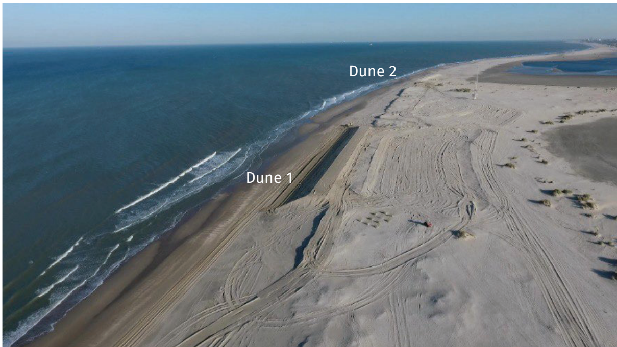
Figure 1: Aerial impression of the field site at the Sand Engine, Kijkduin, the Netherlands

This abstract presents preliminary results of morphodynamic change during these 3 storms, by means of profile changes and erosion volumes.