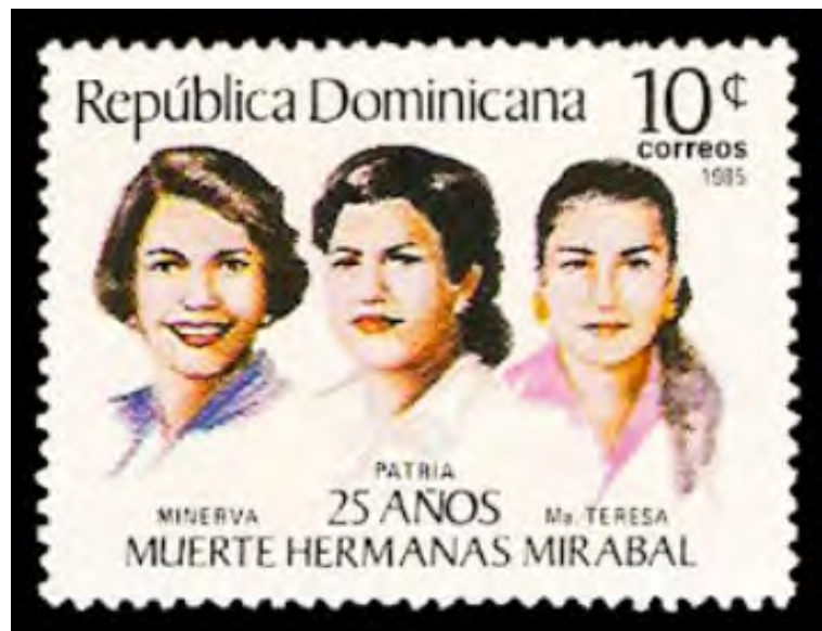
Figure 3. Post stamp with Mirabal sisters from the Dominican Republic.