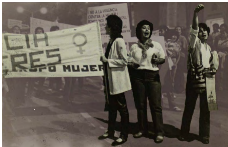
Figure 4. Anger and outrage of the protesters on the 25 th of November in 1981, in Medellín.

In the photographs from the first strike against violence held on the 25 th of November in Colombia in 1981, gathered in the historical archive Vamos Mujer , we can see that the scale of the first edition was already significant, as at least a few hundred people attended. These first massive protests against violence aroused anger and outrage in the participants, as is apparent in the photographs of women with determined gazes and postures, shouting and raising their fists in the air while protesting in the middle of the night. (Figure 4) The banners conveyed slogans: "When a woman is raped, we are all raped"; "We are not dolls"; "We are for utopia."; "No more violence against women". Most of the photographs also show a big doll held by the protesters, representing the objectification of women. Citizens were watching the strike in surprise from the edge of the platforms or the comfort of their balconies (Figure 5). Some of the banners used during the protests on the International Day for the Elimination of Violence against Women related directly to the spatial dimensions of the problem, like the one from a 1985 edition, demanding equal access to public space also after dusk: "At night the streets are also ours" (Figure 6).