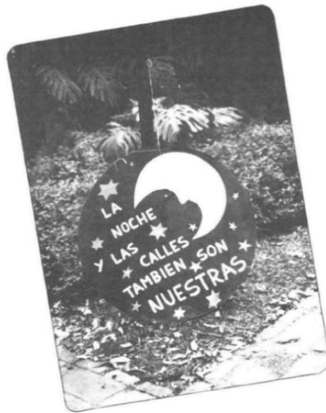
Figure 6. Colectiva de Mujeres de Medellín.

(Women of Medellín collective) A banner for a march "No more violence against women" in 1985.