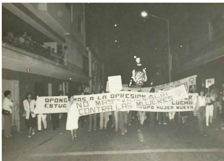
Figure 5. Meeting of Medellín women commemorating the first 25 November in 1981.