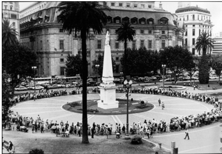
Figure 2. Press photograph of Las Madres surrounding a monument to Argentine independence on Plaza de Mayo.

de Mayo, a space charged with special significance, the seat of government in Argentina since the eighteenth century, associated with the Independence movement. The central element of the square, the Pyramid of May, was a monument to Argentina's independence. Las Madres marked their presence by gathering in a circle around it every Thursday to stress how betrayed this symbol of freedom had been by the violence performed against them and their children. As the dictatorial government banned static meetings, they created a ronda – a circulatory movement in pairs around the monument. A press photographer, Carlos Villoldo captured a moment when they gathered around it in a perfect circle, which gives the idea of continuous movement and unity (Figure 2). With a horizontal framing and a general shot that allows a wide and complete reading of the scene, the photograph gives an account of a large, impactful, peaceful, and orderly protest.