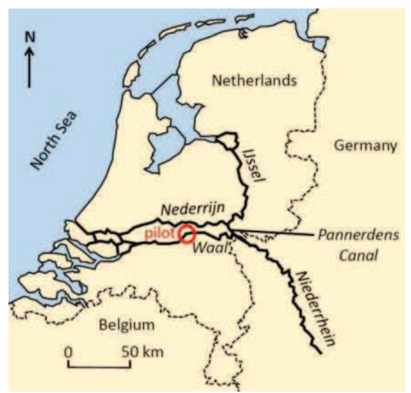
Figure 1. Location of pilot of longitudinal training walls in the river Waal.

The effects on hydraulics and morphology were assessed by analysing field data (De Jong et al., 2021) and carrying out numerical simulations (Paarlberg et al., 2021). The field data comprised water level registrations, flow velocity measurements and bed topographies derived from bathymetric surveys. The effects on how vessel used the waterway were assessed by analysing AIS data (Indah-Everts and Hermans, 2021). The effects on ecological conditions were studied by a broad array of biotic and abiotic field surveys (Collas et al., 2020). Surveys and interviews were used to assess how stakeholders and the local population experienced the pilot with the training walls (Verbrugge and Van den Born, 2021).