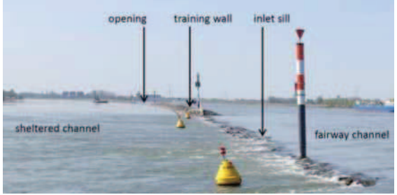
Figure 3. Inlet sill at upstream end of the longitudinal training wall at Wamel.

The system tested in the pilot opens perspectives for integral solution of several river problems. It performs better than the old system with groynes thanks to spatial diversification through separation of functions. The pilot generally confirmed the expectations about the potential of the new system. No unforeseen negative impacts have surfaced. The new system does not solve all river problems completely, but it offers more space for further improvements in the future than the old system (Mosselman et al., 2021).