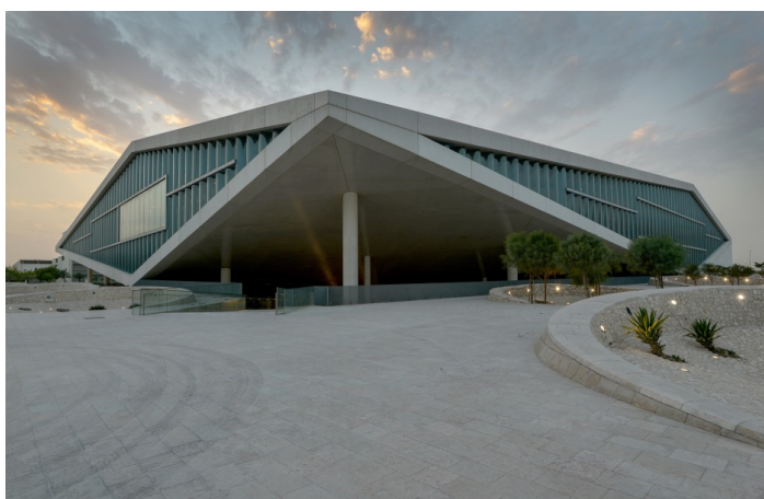
Figure 8. Façade National Library, Doha, Qatar

In 2019 another building with these corrugated glass walls of the architect OMA will be finished: the Taipei Performing Arts Centre in Taiwan. A large theatre complex with a central cube like building of 60 x 60 x 60 meter clad with the corrugated glass panels as we know from Porto and Doha.