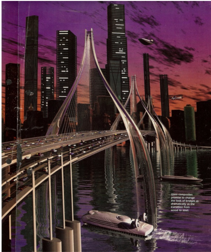
Figure 12. City of the Future 1