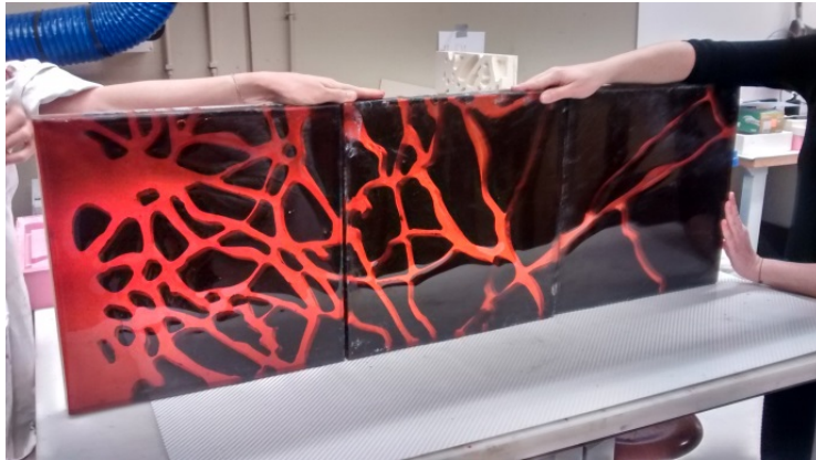
Figure 11. New Marble made of glass and concrete

The results impressed both the architects and the client. We asked for a half year period to work out all possible technical issues since it was to be built in the tropical climate of South Asia. Also we wanted to produce a sizeable mock up with all technical connections. Marketing interest were weighted higher then technical safety, so this project was stopped. Nonetheless, both architect and University are looking for possibilities to continue research in this promising and beautiful direction.