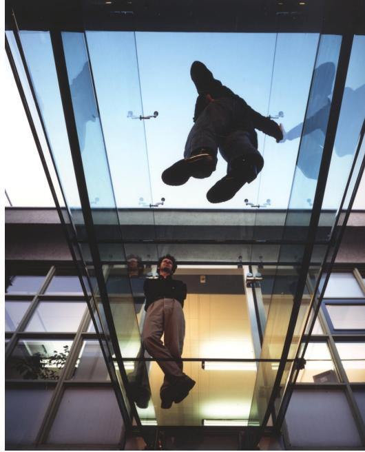
Figure 1. Bridge Rotterdam, the Netherlands

there. Each icicle was formed by 3 triangularly shaped glass panels. Four sets of big beams were laid out at a centre to centre distance of 1 meter. Perpendicular to the big beams 3000 small beams were placed. The bridge was tendered out and proved to be ten times as expensive as a standard steel bridge. A political decision was quickly made and this beautiful design disappeared in the future as un-build. Not everything was lost; for the