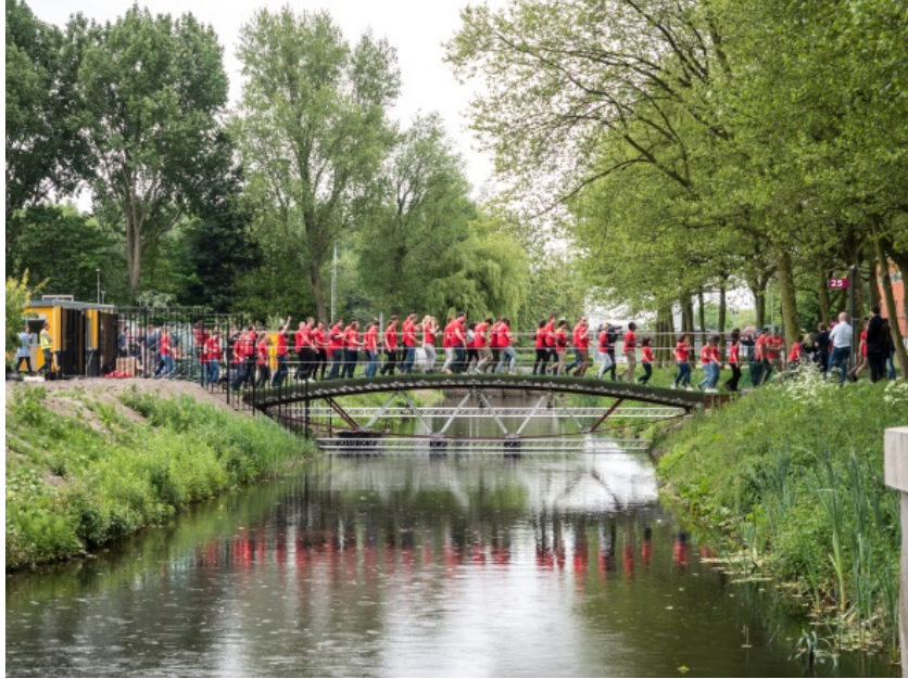
Figure 4. Test loading the Glass Truss Bridge