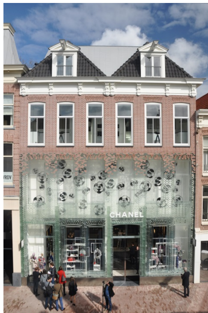
Figure 9. Shopfront in the PC Hooftstraat, Amsterdam, the Netherlands

The client found this an intriguing, beautiful proposal and commissioned Delft University to investigate all critical technological issues like strength, stiffness, water tightness, insulation value, temperature/ sun radiation induced movement etc. After this research the choice was made for cast glass massive bricks and window frames. The bricks are glued together by an adhesive that hardens in a few minutes under ultra violet light. An extra small layer of silicone in each joint is used to safeguard the water tightness. Since this is the first time that on this scale, in outside conditions, a façade composed of glass bricks is built, the quality control, both in the factory and on the building site, was done by Delft University.