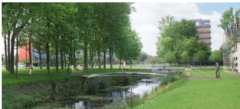
Figure 10. Artist impression of the Glass Arch Bridge

Therefore, a rather thick layer of glass stones must be installed to produce such a big compression that tensile stresses caused by big local point loads are always eliminated. We entered a competition for a “sustainable” bridge for the Green Village of Delft University of Technology which we won (see section 1.3). We are now (spring 2018) running all kinds of research to prove the technical issues regarding an all glass arch with a thin layer of plastic in each joint, no adhesive, to make it demountable and reusable.