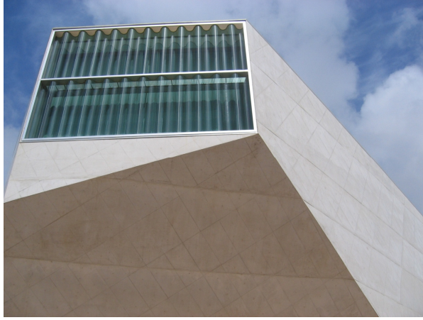
Figure 6. Façade Casa da Musica, Porto, Portugal