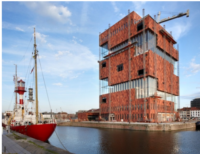
Figure 7. Façade of museum MAS, Antwerp, Belgium

The city of Antwerp, Belgium had a number of small museums housed in circumstances not fit for museum objects. It was decided to concentrate all these museums in a little island in the old harbour of Antwerp (fig. 7). An international competition was held and the architectural firm Neutelings Riedijk won. Their design was a stack of concrete rectangular boxes, each rotated 90 degrees to its neighbour. In this way the public could walk up slowly in a big spiral staircase, visiting each box i.e. museum, one by one. To protect people from rain, cold and wind the architects decided to use the same corrugated