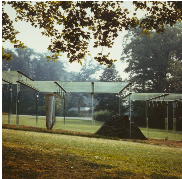
Figure 5. Sonsbeek Pavilion, the Netherlands

The architects and engineers worked out the structural design for this temporary structure (March to October 1986). It was composed of glass portal frames, centre to centre 2.5 meter, made from two vertical glass fins and a horizontal, very light, steel truss. The fins gave support against the wind forces, the steel truss supported the glass panels that formed the roof. The transversal stability was given by the portal frame action of the two glass fins and the steel truss, the lateral stability was provided by the Vierendeel (shear force) action between the glass panels in the facades, the connecting silicone joint provided the structural connection between the glass panels.