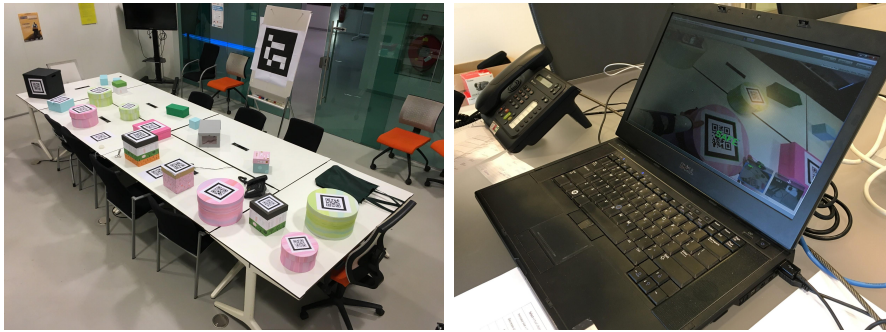
Fig. 1. The game setup for the local players (left) and the remote player (right)

evidence in the form of blue and red Lego blocks. The other local player can collect green and yellow Lego blocks. None of the players can collect a white Lego block; they are considered dangerous and possibly explosive.