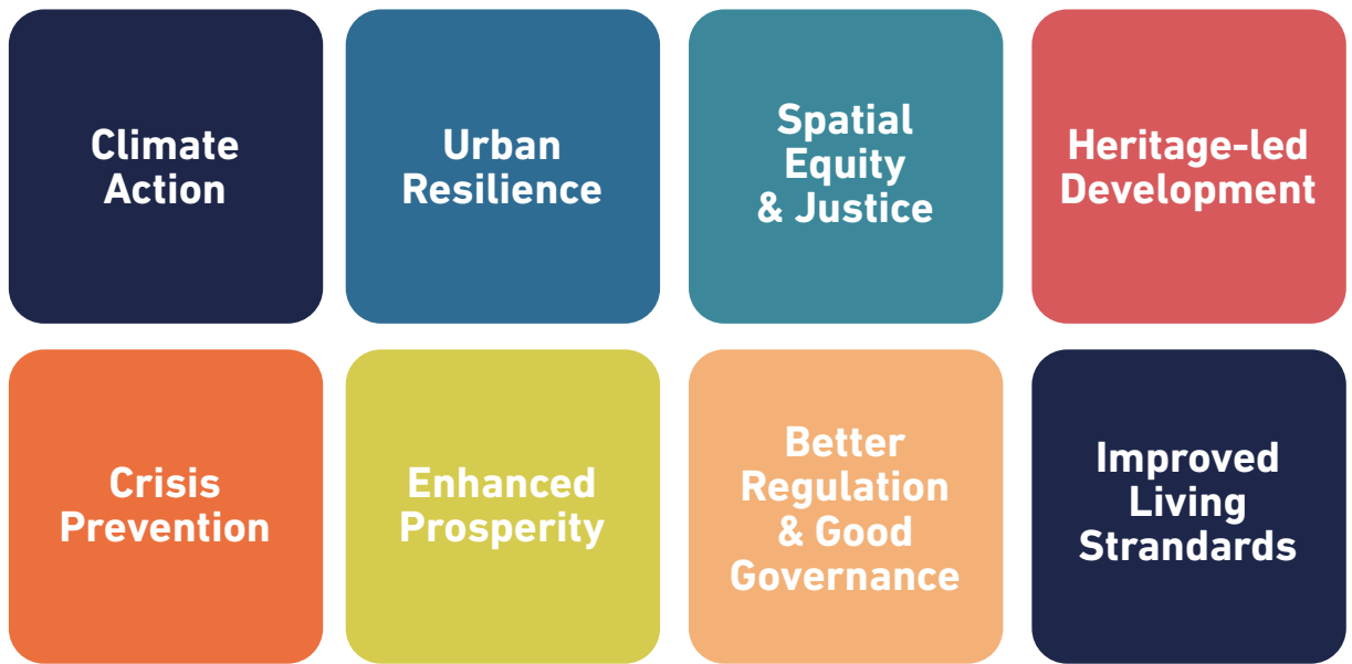
Figure 2: The Action Plan's intended outcomes.