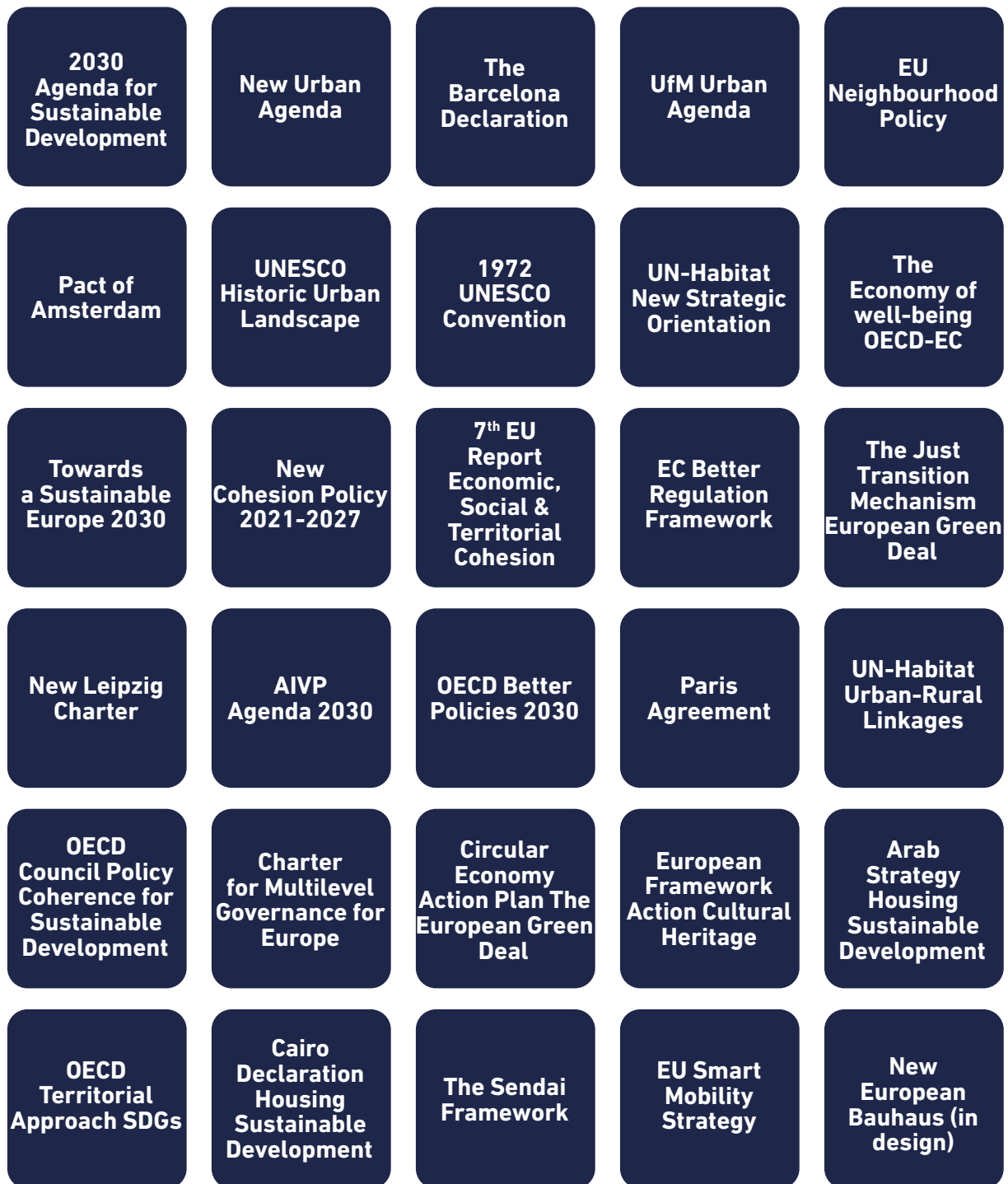
Figure 1: Main policy frameworks used in the elaboration of this Action Plan.