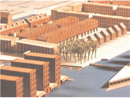
Figure 1 and 2. Milled fencing and window frames (scale 1:50) in 0.2 mm airbrushed plastic.

After performing an extensive 'market' investigation for all sorts of rapid prototyping techniques, we have come to consider a selection of techniques as specifically interesting for the intensive use in an educational setting.