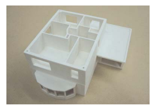
Figure 5. 3D printed construction details (full scale model) from starch based powder.