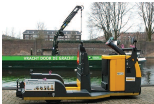
Figure 3. The Mover (Mokum Mariteam, 2012)

When the vessel are loaded, they sail among the old canals to the inner-city (see Figure 2). Not all the canals are suitable for these freight vessels. In our model dedicated canals are specified considering the width and headroom of the vessels (an de Kamp, 2016).