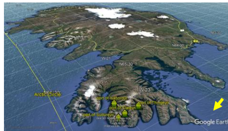
Figure 1- Location of the Ports